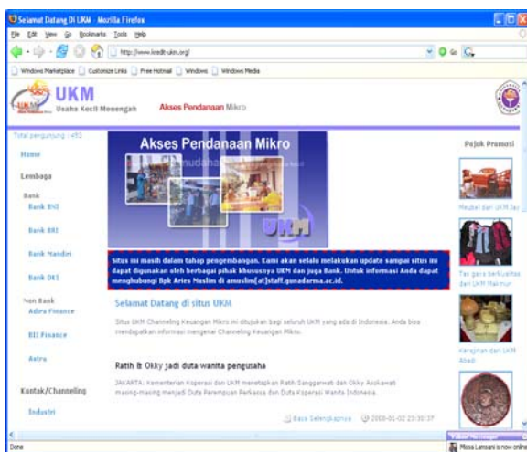
Figure 1. Main Portal Display

Activity of socialization result this research take place Thursday, 3 January 2008, in Gunadarma University. In this activity, besides filled socialization research result, also filled with policy program socialization and guidance from Minister Cooperation and SME's Republic of Indonesia. Banking, especially from BNI and Bank DKI also partake to fill event given comments to research result and micro financing program.