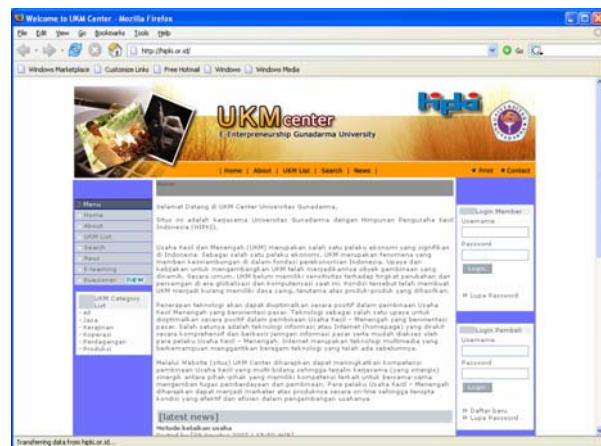
Figure 3. Link to Website HIPKI