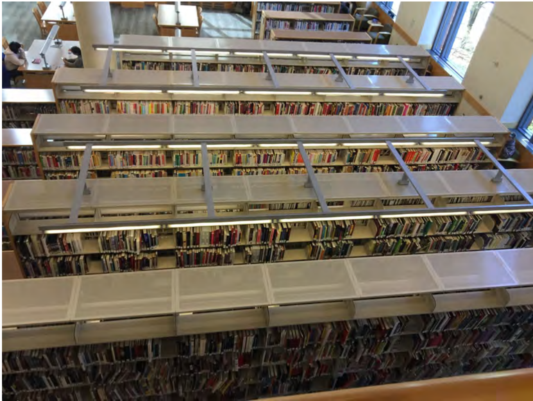
Stacks in the Eugene Public Library.