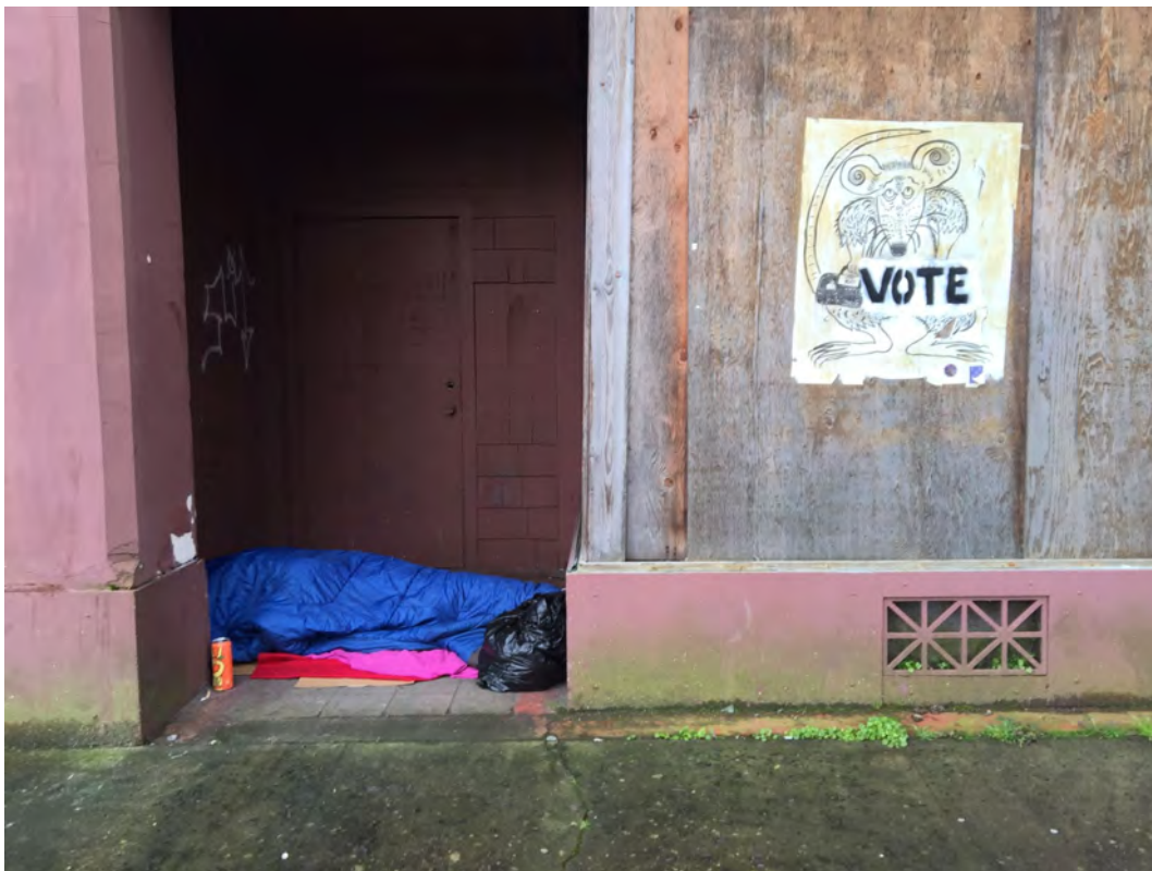
A homeless person sleeps outside the abandoned Waldorf Hotel in Astoria, Oregon. The hotel is directly adjacent to the Astoria Public Library and is in the process of being turned into 40 units of lower income housing.

The low, red and blue colored lawn chair style cushioned chairs at the Astoria Public Library on the main floor are often occupied all throughout the day. Some people are reading while others are just sitting and enjoying the quiet space. The six desktop computers next to the chairs are constantly occupied. “For me a library is free and you come in. You don’t have to be