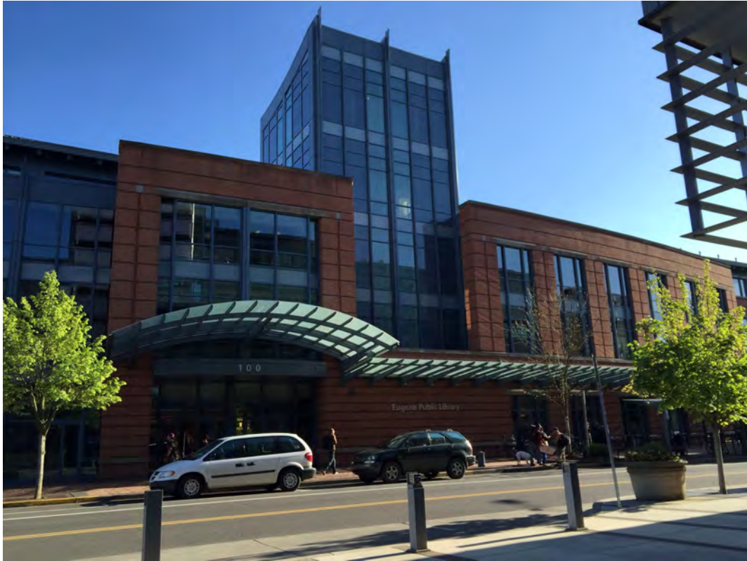
The Eugene Public Library on a warm Friday in April.

The library sits directly across the street from Lane Community College and the Eugene Station transit center. Many police officers can be seen patrolling the square outside.