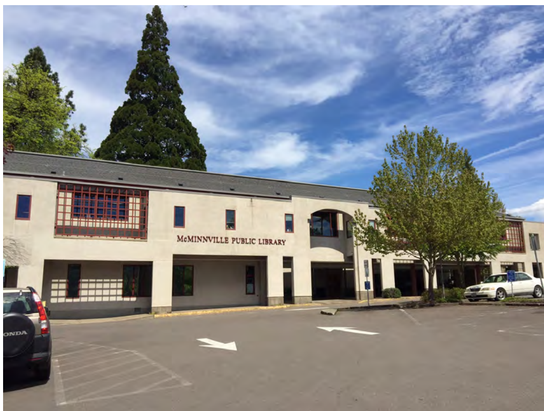
The McMinnville Public Library.