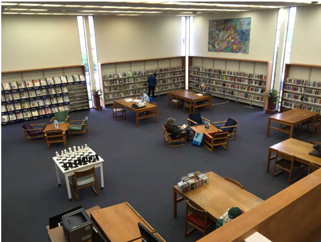
Patrons sit and read and browse the stacks at the Astoria Public Library.

Opened in 1966, Astoria's library has been a contentious topic among city residents. For more than 10 years the city has explored options of building a new multimillion-dollar library or renovating the current one. The City Council ultimately turned down plans for a new library in favor of a renovation due to lack of public support to fund the cost of building a new library. Though the library is not often crowded and is quiet, currently only able-bodied people can access books from the mezzanine since it does not have an elevator.