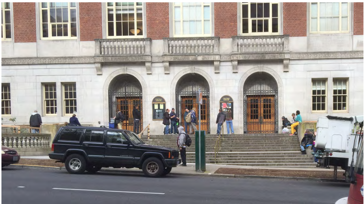
A throng of people, some who are homeless, wait for the doors to unlock at Central Library in Portland.

A little more than 20 people wait outside Portland’s Central Library on a clear, brisk Friday morning 15 minutes before it’s supposed to open at 10 a.m. There is a collective sense of anticipation and excitement among those waiting to get in. People are sitting and standing, listening to music and reading, chatting – a man near a bench watches a TV show on his tablet without headphones on for all to hear. As the time neared that the library would open, more people gathered on the front steps. The wrought iron gates barring the entrance to the library