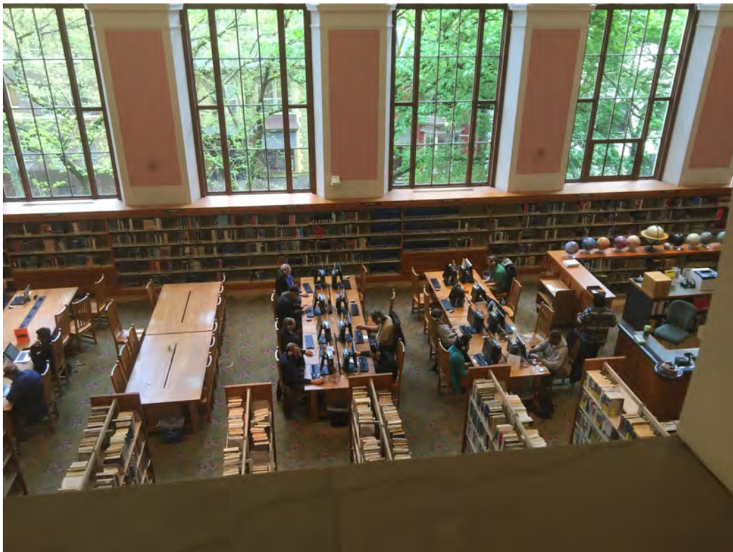
Annually, more than 70,650 people use the library's computers.

A man carrying a giant plastic bag slung over his back usually used to recycle beer cans instead shows his clothing and sleeping bag inside it. Many of the homeless people are silently reading, on laptops or their phones, or are using desktop computers or are just enjoying the quiet the library affords them. Stacked neatly on shelves are national and local newspapers, with ones from every city and town in Oregon available for patrons to read. An older, short woman wearing a blue hat with buttons says loudly to a staff member working at a reference desk “It’s just comforting. I love this place!”