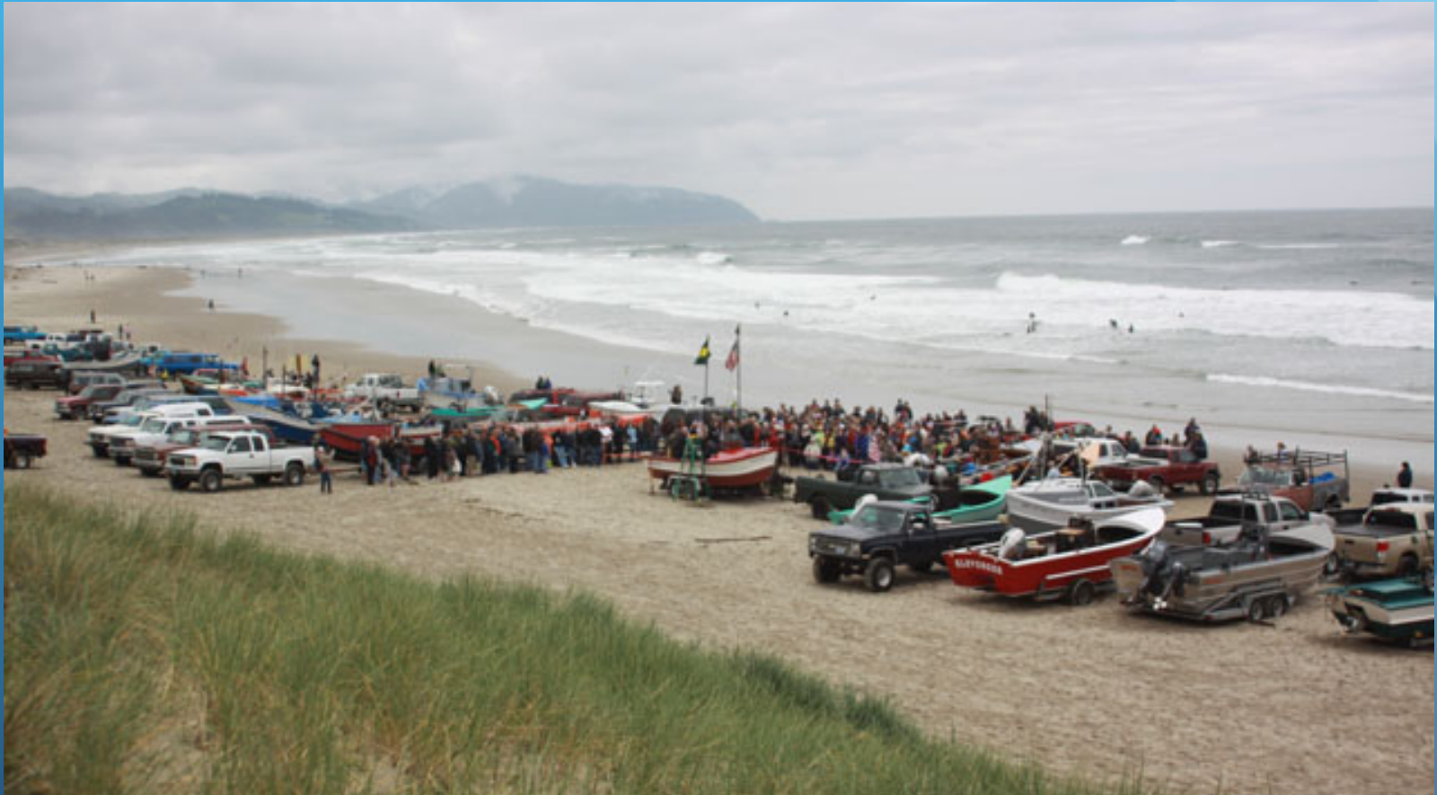
The Blessing of the Fleet June 2012