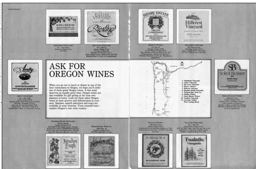
One of the early collaborative advertising efforts was this magazine spread from the late 1970s, encompassing wineries from across the state. The concept of “Oregon wine” as a brand was just starting to emerge.

for more than 800 attendees requires strong cooperation within the hosting wine community, and that simply does not exist outside of Oregon. 37