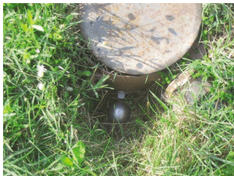
Figure 1. Stabilisation of benchmark R100.

The reference benchmark R100 (Figure 1) at the radioactive waste storage is stabilised with a deep concrete pillar with a longitudinal plate, metal rod and a protective cover. To the east and west of the NEK plateau there are two reference benchmarks RII and RIV stabilised (Figure 2), which are built in horizontally into the reinforced concrete monitoring masts with deep underground foundations.