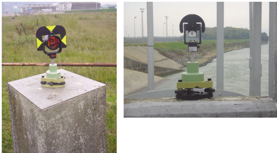
Figure 3. Stabilisation and signalisation of the reference and control points.

the levelled above-sea-level heights of reference and control points. The coordinates of reference points are determined in order to establish their positional stability and determination of the geodetic datum of the network. The horizontal angles are measured according to the sets of angles method, both ways between the reference points and in one-way to the control points. Slope distances and zenith angles were measured simultaneously. The method enables the identification of statistically significant horizontal displacements of control points on the dam.