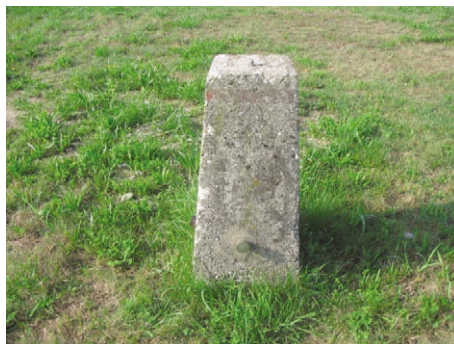
Figure 2. Stabilisation of benchmark RIV.

The control points in the structures are stabilized in the centre of the structure, so that they move together with the structure. In the outside areas of NEK's structures, the low benchmarks were built into the walls, however, inside, the benchmarks were mostly stabilised on the ground.