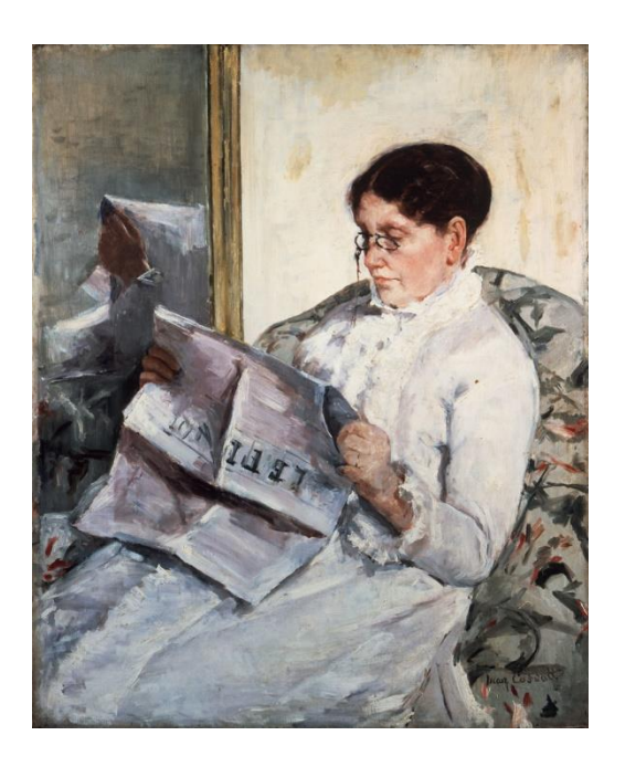
Figure 1. Mary Cassatt, Reading Le Figaro , 1878 (private collection).