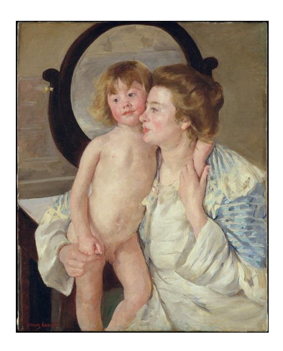
Figure 4. Mary Cassatt, The Oval Mirror , 1899 (Metropolitan Museum of Art, New York).