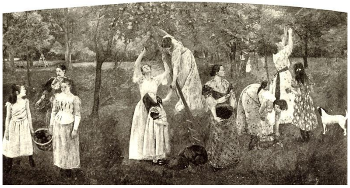
Figure 2. Mary Cassatt, Modern Woman (detail), 1892-93 (unlocated).