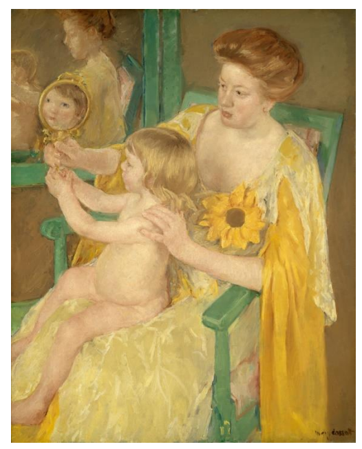
Figure 5. Mary Cassatt, Mother Wearing a Sunflower on Her Dress, c. 1905 (National Gallery of Art, Washington D.C.).