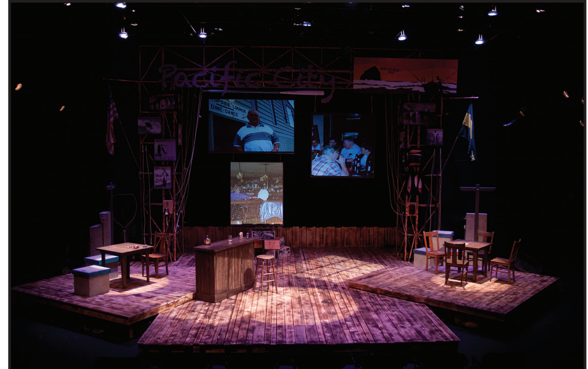
Act I—Set shot of the Sunset West, 1978