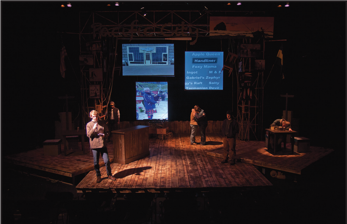
Act I, Scene 9—Reading of Names, Blessing of the Fleet, 2012