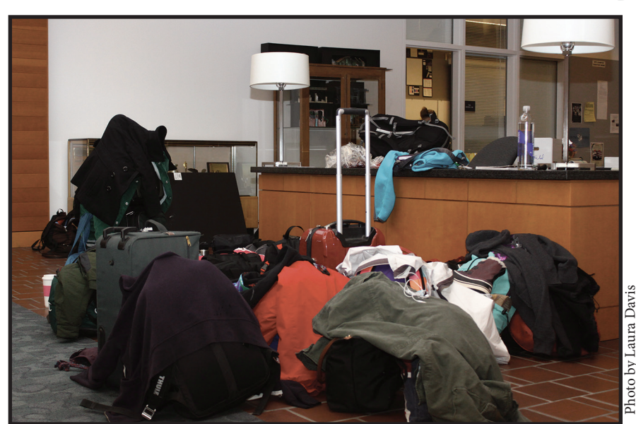
Luggage for the cast and crew is ready to be loaded for the trip to Pacific City.