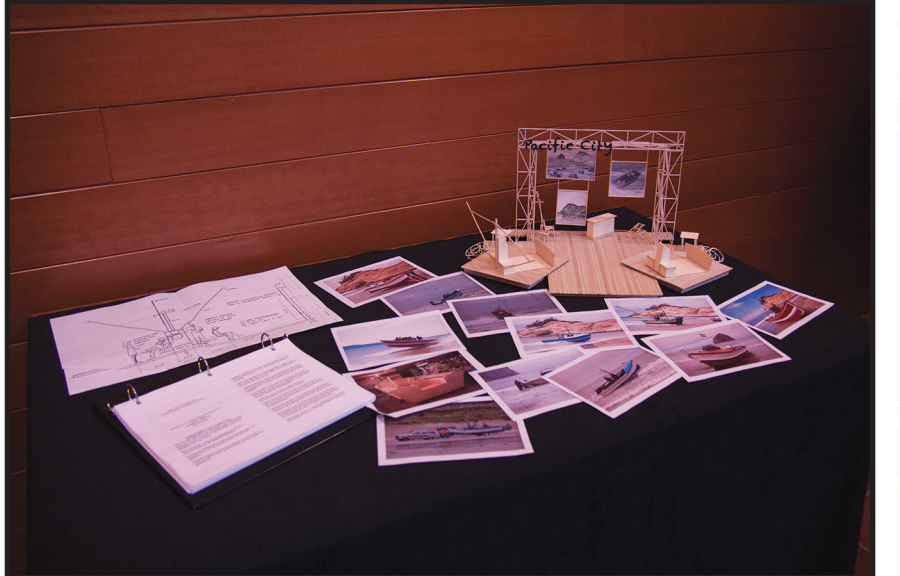
Scenic model with research images