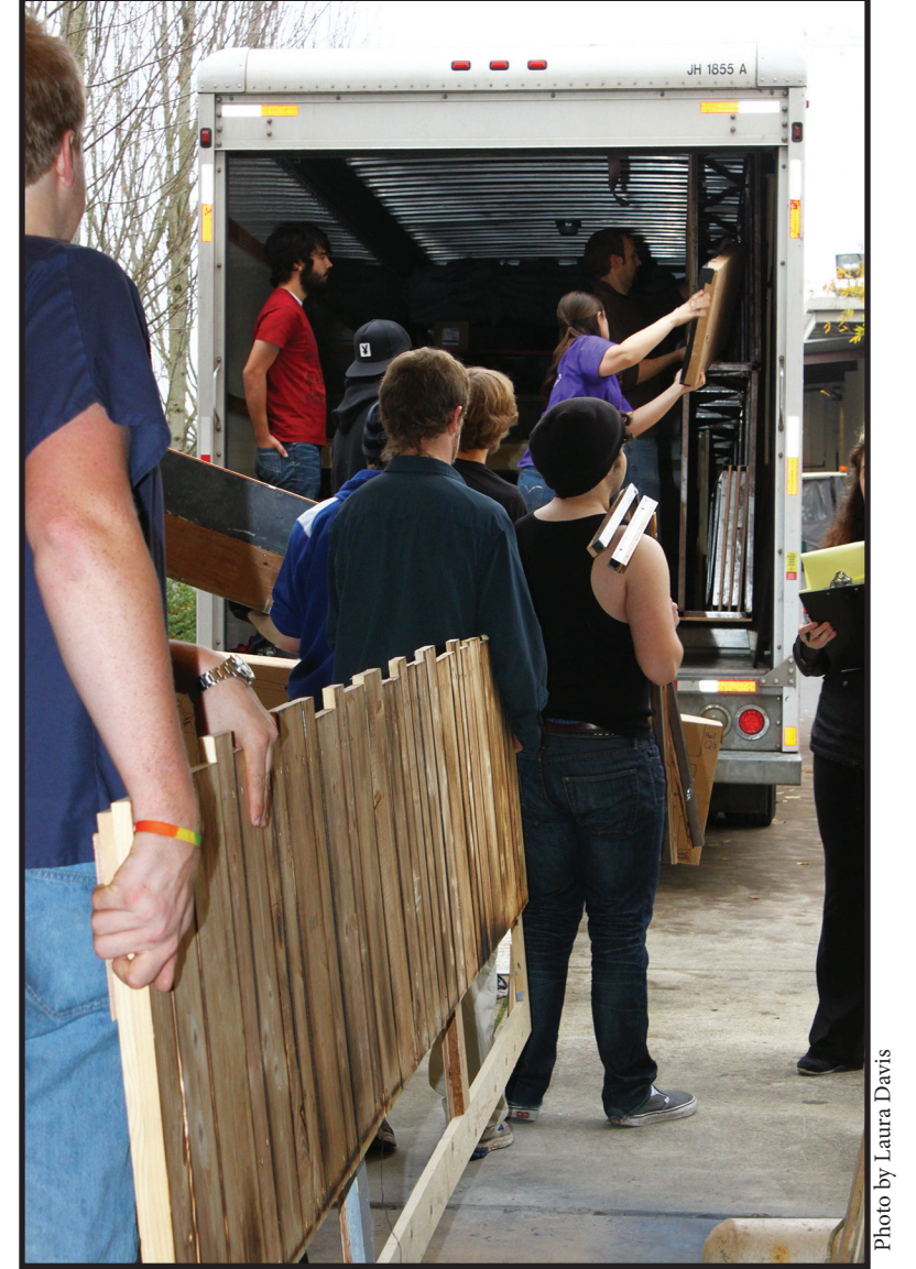
The Company is ready to head to Pacific City after loading the trucks.