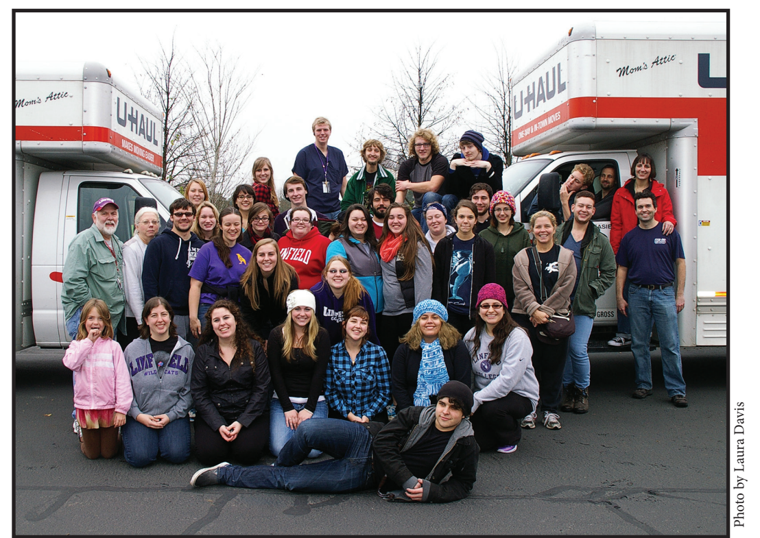
The Company is ready to head to Pacific City after loading the trucks.