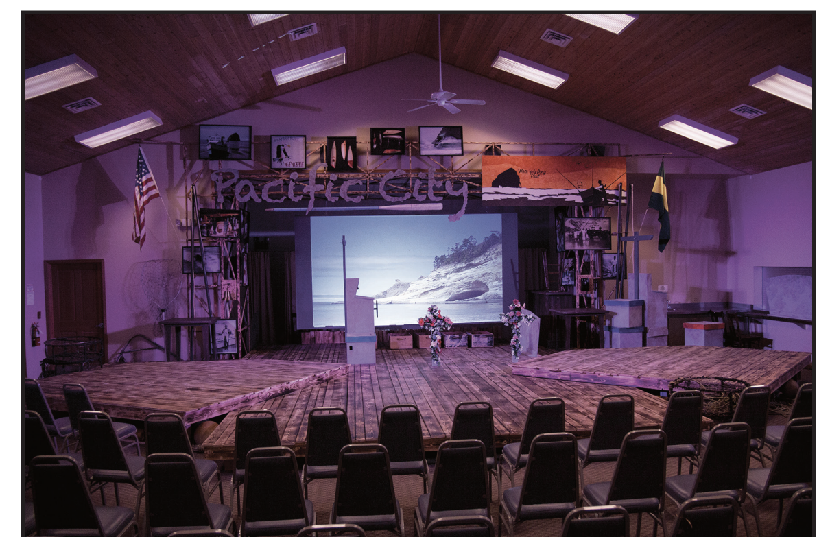
Load in completed and space ready for the performance