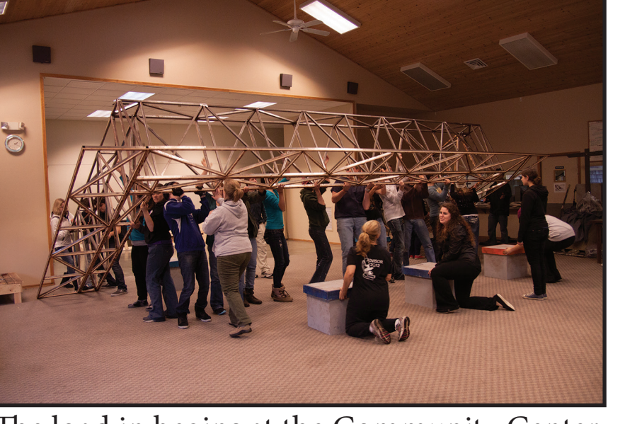
The load in begins at the Community Center.