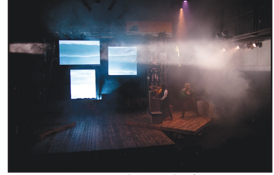
Act I, Scene 7—Landing in the fog, 1978