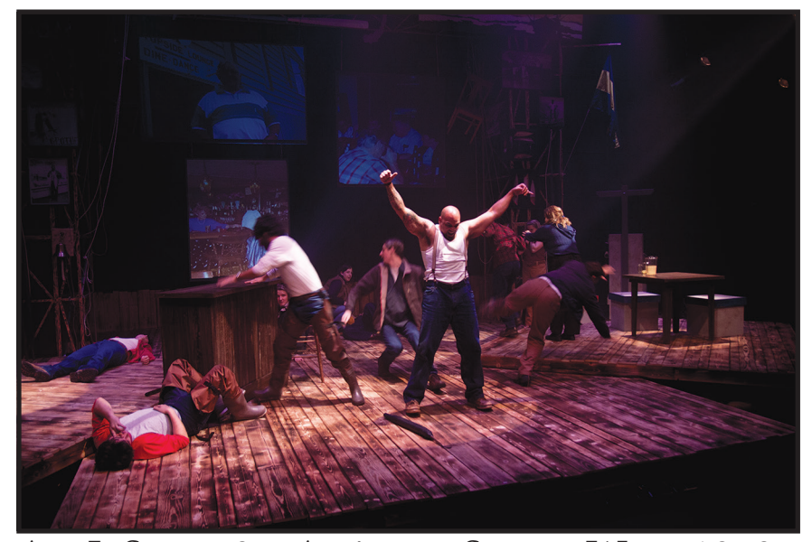
Act I, Scene 8—Action at Sunset West, 1978