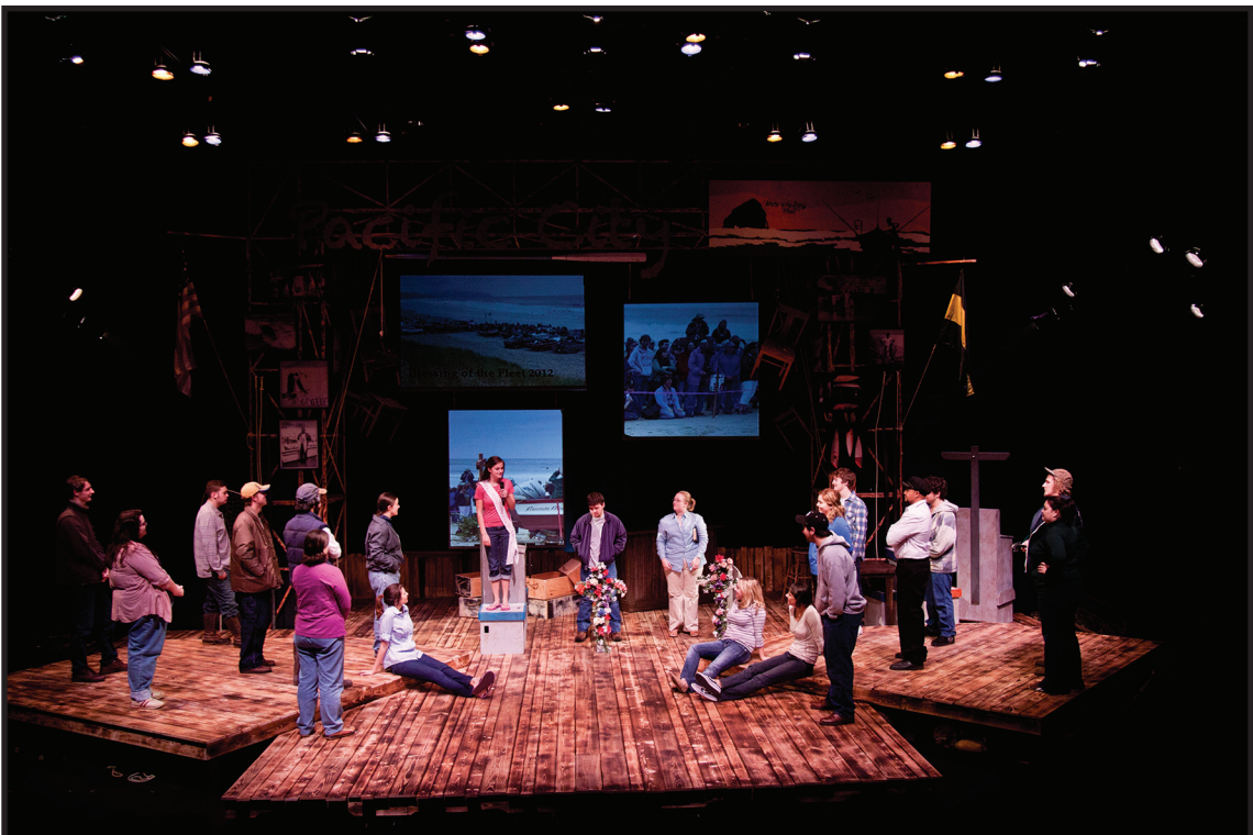
Act I, Scene 1—Blessing of the Fleet, 2012