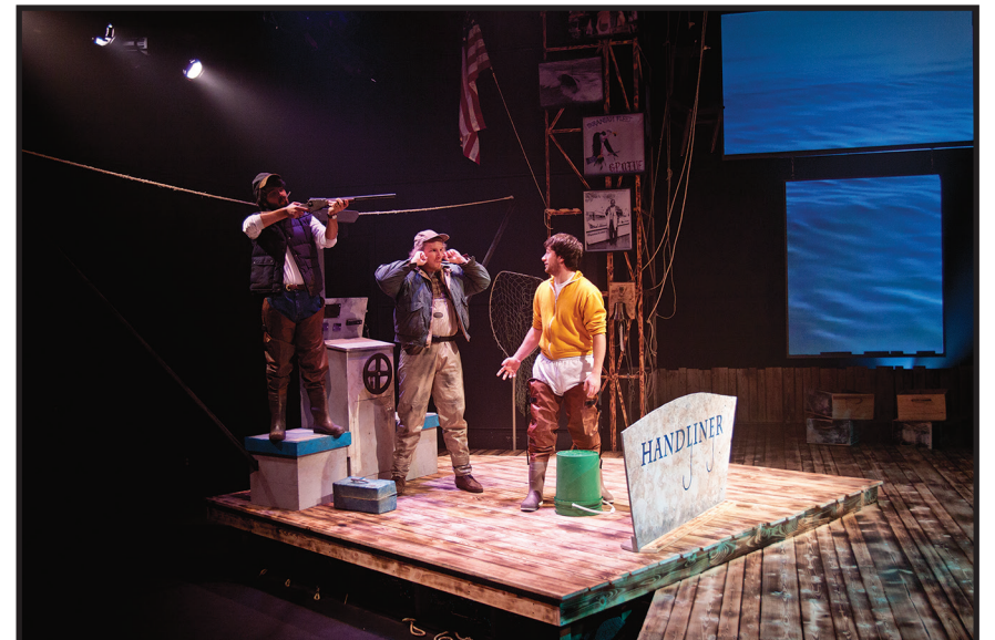
Act I, Scene 5—Aboard the Handliner, 1978