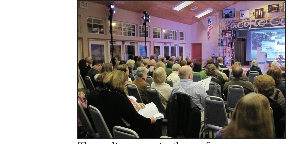
The audience awaits the performance.