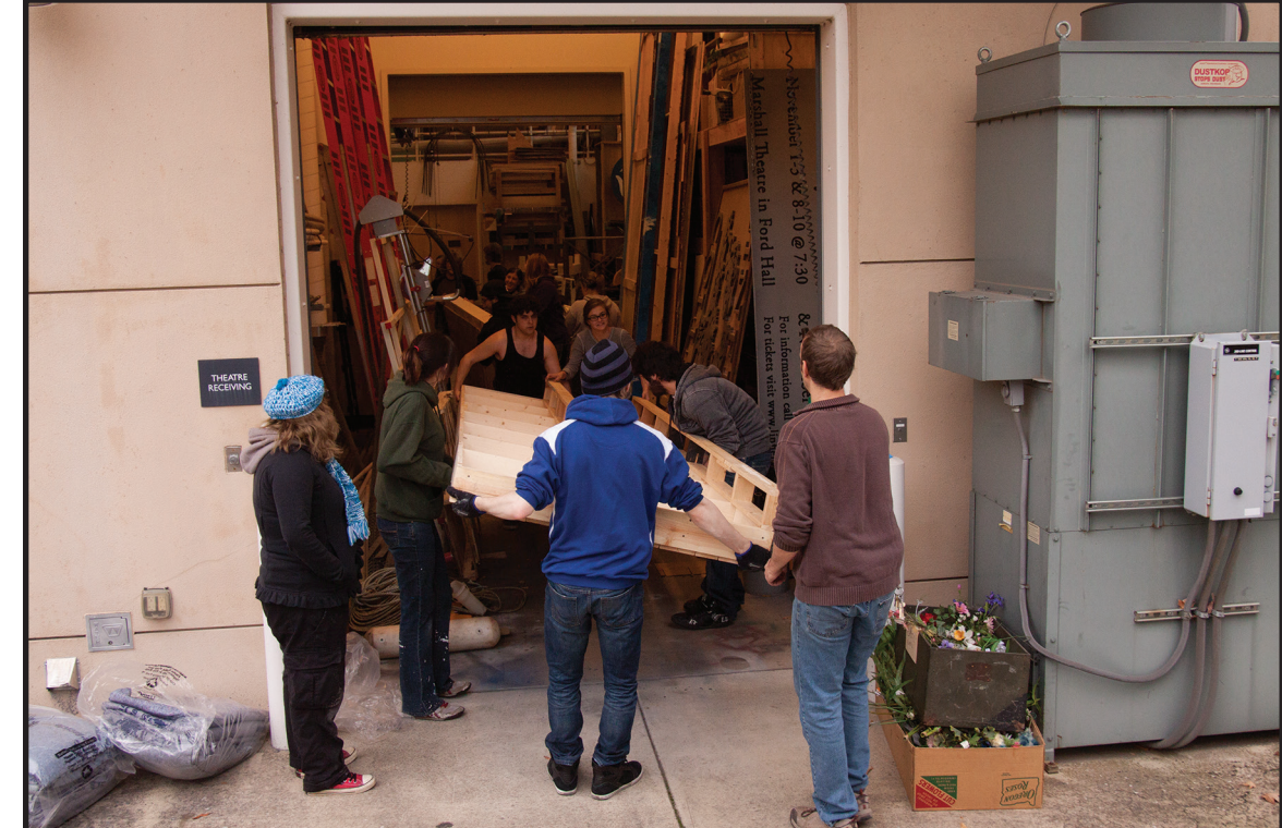
Loading scenery into trucks for the tour to Pacific City