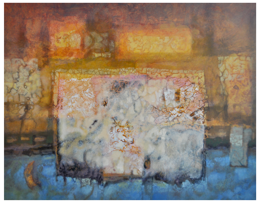
Waiting for You (Te espero), 2010, acrylic on canvas, 32" x 42"

Mills's paintings are interesting because they integrate prosaic and poetic visual experiences we all share with his own emotional states to arrive at canvases that are simultaneously idiosyncratic yet uncannily familiar. A Mills painting may suggest, the dappled shadows of light through a deciduous tree, patterns cast by wrought iron railings, ephemeral forms dancing in the shadows cast by banners or flags flapping in the wind, the reverse roll of a car's headlights on an interior room at night, the articulated light passing through window shutters, the cellular, fractured reflections of stained glass. Each of these chromatic anecdotes serve as inspiration for Mills as he layers his canvases with the details of his immediate context, both as regards his physical surroundings and his emotional state.