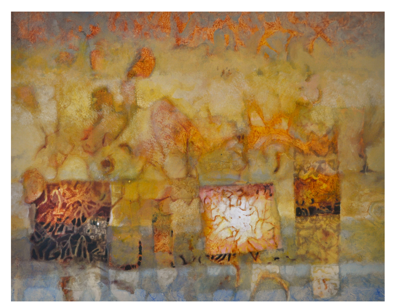
Who and What Inspires me? (¿Quién y qué me inspira?) 2010, acrylic on canvas, 32 x 42"