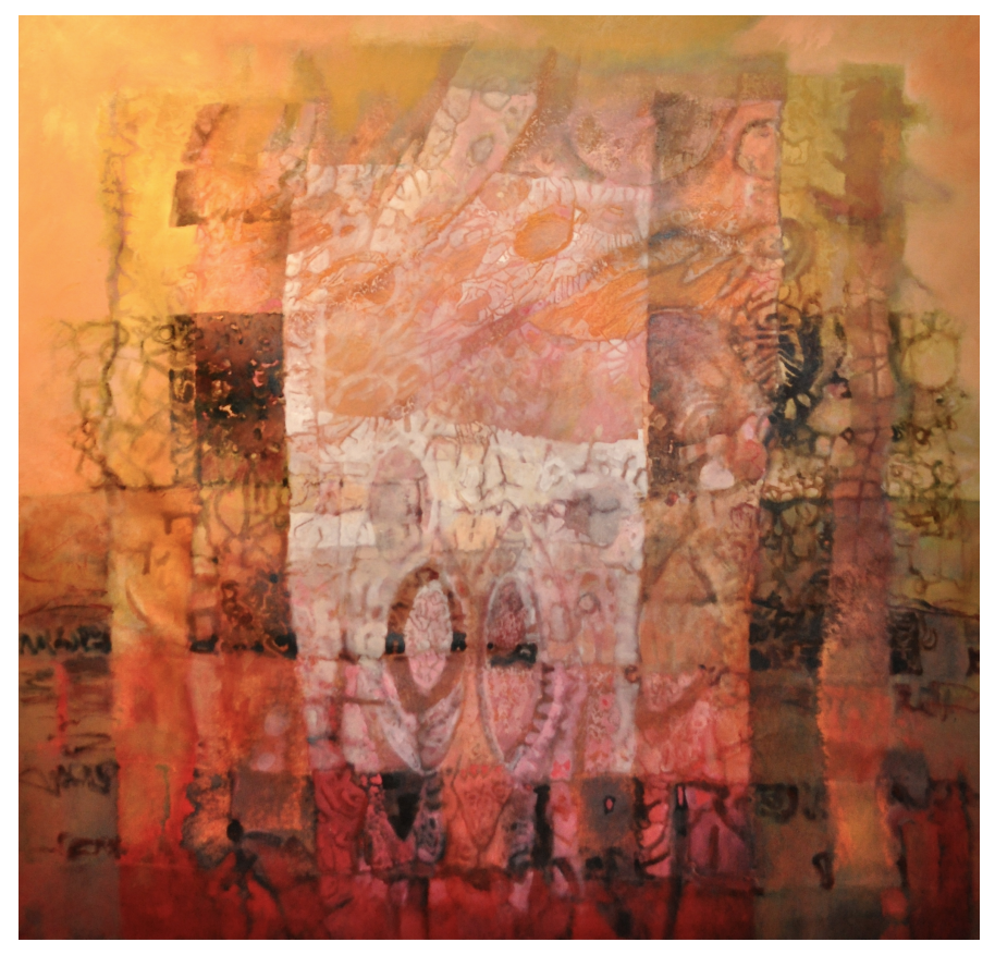
The Past in the Present ( El pasado en el presente) 2011, acrylic on canvas, 46" x 42"

<sup>9</sup> Donald Kuspit, "Visual Art and Art Criticism: The Role of Psychoanalysis," Signs of Psyche , Cambridge: Cambridge University Press, 1993, p. 312.