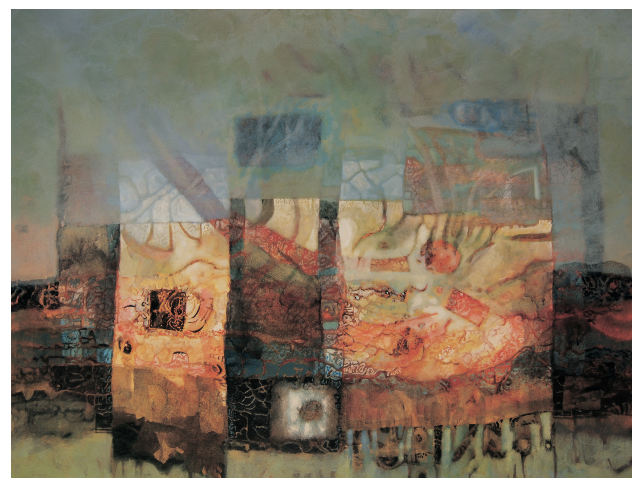
Thirteen Portals (Trece Portales) 2010, acrylic on canvas, 32" x 42"