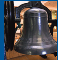
Exhibit honors Good Sam legacy