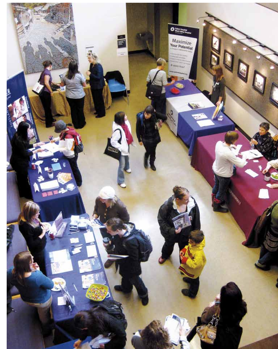
Linfield College students had an opportunity to speak with potential employers at a recent Career Fair in the Cameraworks Gallery in Peterson Hall. The college hosts two career fairs each year.