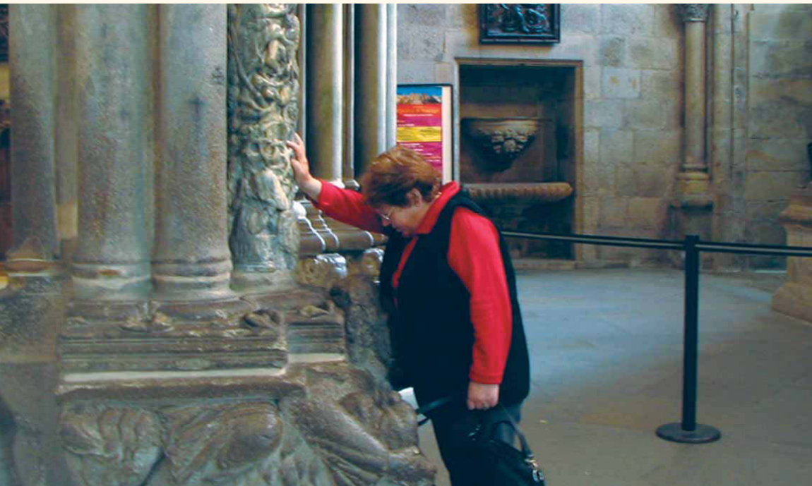
A pilgrim touches the Tree of Jesse at the Cathedral in Santiago. The pillar is worn from the touch of the millions who have made the pilgrimage from across Europe and around the world.

hands of millions before have left their prints. He tapped the forehead of Maestro Mateo, the builder of the gate. He walked to the altar of St. James, under which lies the saint's tomb, and gave thanks for all who had helped him on his journey – those who gave directions, provided food and housing and offered friendship to a stranger. He placed his hand on the statue of St. James, marking the end of his journey. Twice he was nearly overcome with emotion – when he received his certificate, recording the completion of his pilgrimage, and when they announced it at mass the following day.