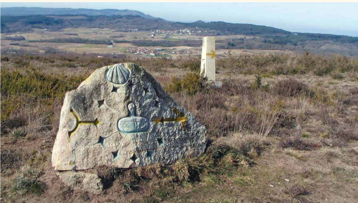
Markers along the trail in Galicia mark the direction to the journey's end. Galicia is the province in which St. James is said to have preached before he returned to Jerusalem and was martyred.