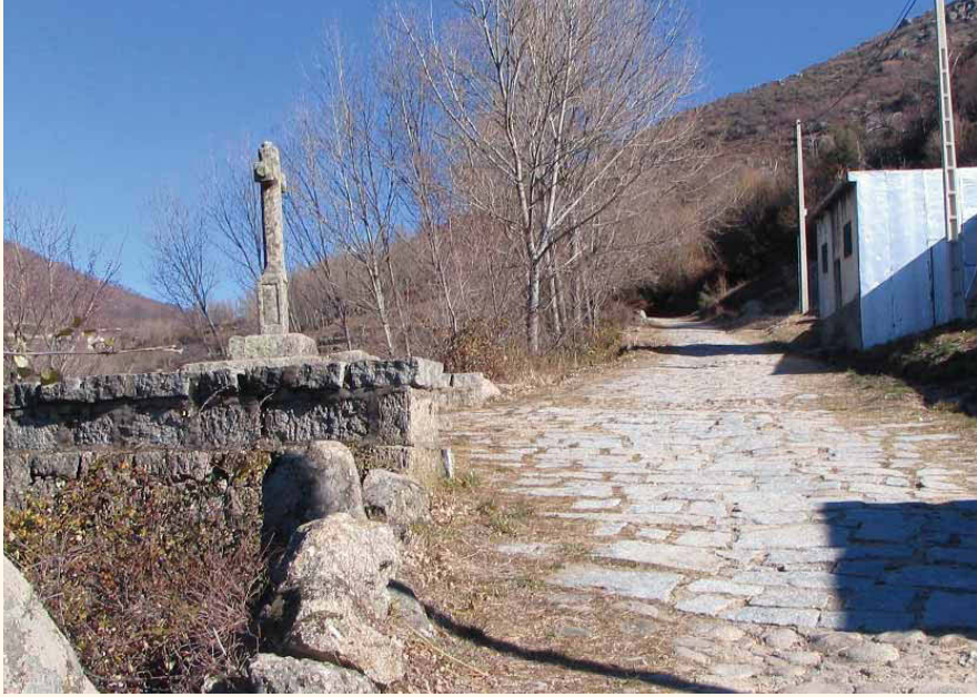
The road built by the Romans is still visible and often the trail follows it. There are a number of Roman bridges still in use throughout the country.