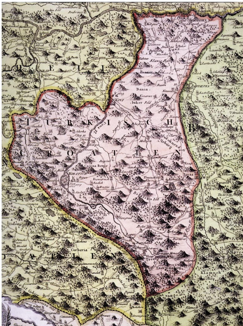
Fig. 4. Schimek's Map of the Turkish Croatia, 1788. (Facsimile from Marković 1998).