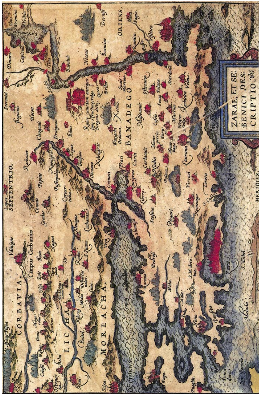
Fig. 3. Bonifačić's Map of the surroundings of Zadar and Šibenik with the region of Morlacha, 1573. (Facsimile from Marković 1993).

Sl. 3. Bonifačićeva Karta okolice Zadra i Šibenika s morlačkom regijom, 1573. (Faksimil iz Marković 1993.).