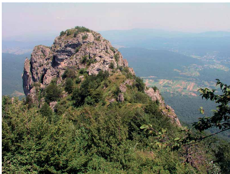
Fig. 3. Klečice (Klek Mt.) – newly found habitat of Erebia stirijs kleki Lorković, 1955 in Croatia.

In fact, LORKOVIĆ (1955) had assumed that E. stirijs kleki could be found on the 0.6 km distant Klečice rocks (1062 m). He did not confirm it because at the time of his field investigations there was cloud, which is generally unsuitable for butterfly activity. Klečice nowadays is not easily accessible. It is characterized by a few meter high calcareous rock/cliff belt partly overgrown by vegetation. This is a typical cliff vegetation of Sesleria tenuifolia Schrad. ssp. kalnikensis (Jav.) Deyl. growing on shelves