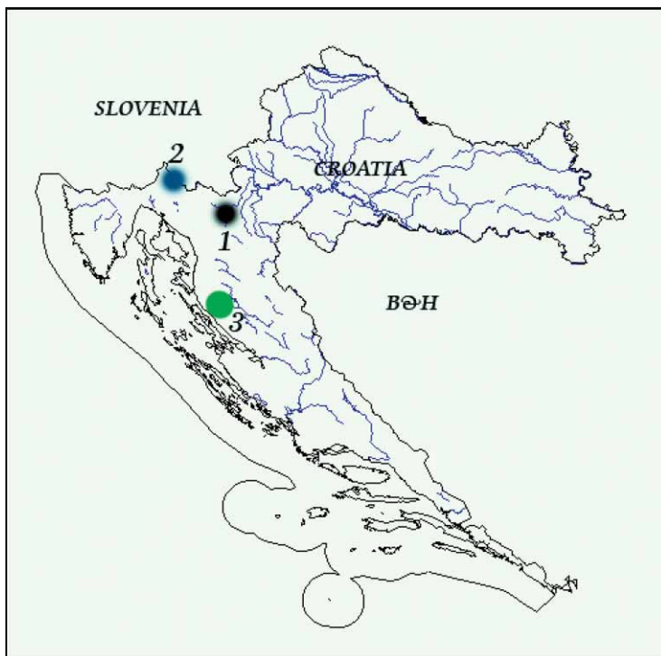
Fig. 1. The distribution of Erebia stirijs (Godart, 1824) subspecies in Croatia: 1 – Erebia stirijs kleki Lorković, 1955 (Bukovnik, Klek Mt. peak, Klečice), 2 – Erebia stirijs gorana Lorković, 1985 (Čučak, Pauci), 3 – Erebia stirijs nerine (Freyer, 1831) (Baške Oštarije – Velebit Mountain)

E. stirijs gorana is restricted to the Čučak and Pauci sites in Croatia and several more in Slovenia (Kuželj, Mirtoviči, Bosljiva Loka, Grintovec and Ribjek), all in upper course of the Kupa River (MLADINOV, 1978; LORKOVIĆ, 1985), so E. stirijs gorana is not endemic for Croatia (Fig. 1). According to the Red Data List of Butterflies of Croatia Klek's Styrian Ringlet is in the Data Deficient (DD) category and