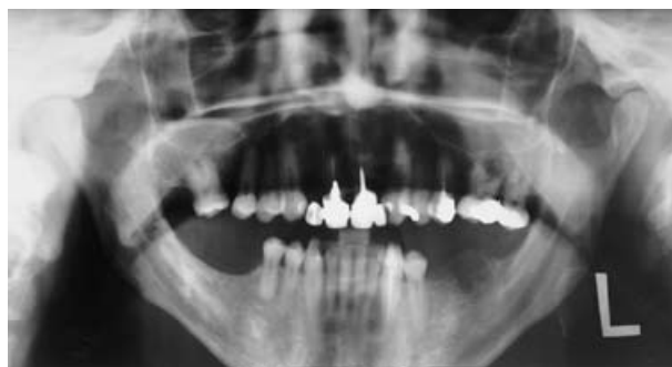
Slika 2. Panoramska snimka pokazuje radiolucenciju s nepravilnim rubovima u molarnoj regiji donje čeljusti.