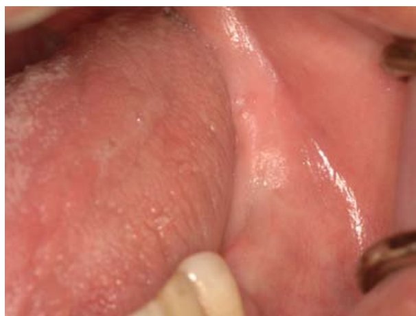
Slika 4. Inspekcijom usne šupljine nađena je potpuna remisija bez ikakvih kliničkih znakova bolesti.