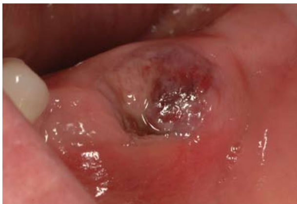
Slika 1. Intraoralna fotografija koja prikazuje neadekvatno cijeljenje postekstrakcijske alveole u području donjeg lijevog trećeg molara.