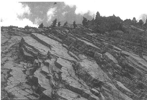
Fig. 2 Kozja Dnina, the type-locality of Valvasoria carniolica n.gen. n.sp.

allel transverse and oblique lines are seen under electron microscopy. In some places, two pores unequal in size appear closely together (Pl. I, Figs. 2, 3). The internal surface of the cuticle shows a relief structure, which can be observed in traces (partly shown on Pl. I, Fig. 4). In the middle part of the preserved holotype body annulation can be observed. It is represented by five circular belts approximately 0.1 mm wide. Distances between belts are 0.5 mm and 1 mm. The belts are composed of longitudinally arranged alternating fine ridges and grooves.