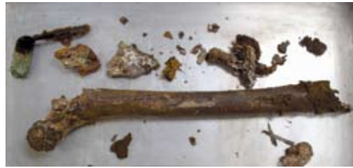
Figure 2. Human femur (sample 1) allegedly collected near a 1945 plane crash site in the Philippine Islands.

remains was conducted at the AFDIL. Sample 1 was a human femur whose potential origin was an American soldier killed in 1945 in a plane crash on Negros Island, Philippines (Figure 2). Sample 2 was a human femur from one of four men lost in a 1943 plane crash in New Guinea. Both samples yielded no genomic DNA when quantitated with real time PCR.