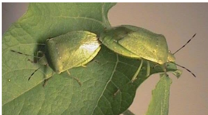
Picture. 1: Southern green stink bug Nezara viridula . Couple mating on a bean.

Efficient pest control of N. viridula is nowadays achieved by the use of high doses of insecticides applied over wide areas. This species has long been a target for biological control, mainly through the introduction of parasitic wasps and flies [5, 13]. However, recently the degree of success in many parts of the world has been seriously questioned [6, 12].