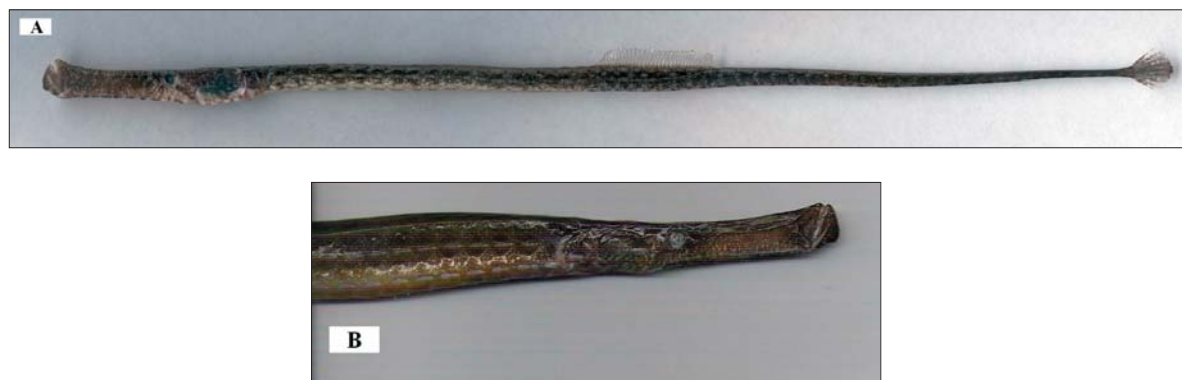
Fig. 2. A: Syngnatus typhle (SYN-Syt-10) caught in Tunis Southern Lagoon; B: Detail of head (SYN-Syt-10)

Specimens from MNHN were from nine different origins, and were not statistically supported by sufficient data to be compared with the Tunisian specimens, so they were included in the same sample. Some relationships between Tunisian samples and MNHN samples, such as HL/PrAD; HL/TL; SnL/HL; PrAD/TL; PrD/TL; PrOL/HL; PsOL/HL; DL/DB; DB/TL; ED/HL