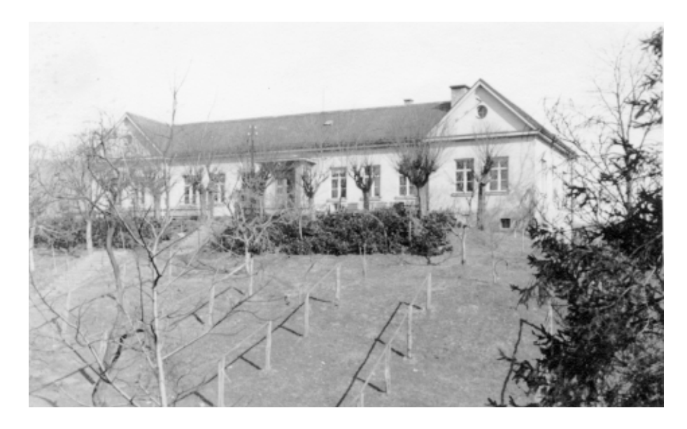
In 1904, Department of Pediatrics was located in this building.