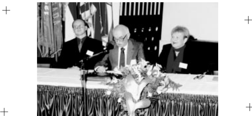
Fig. 2. Presidency of the Congress

The following posters were proclaimed most successful according to the evaluation by poster section moderators: