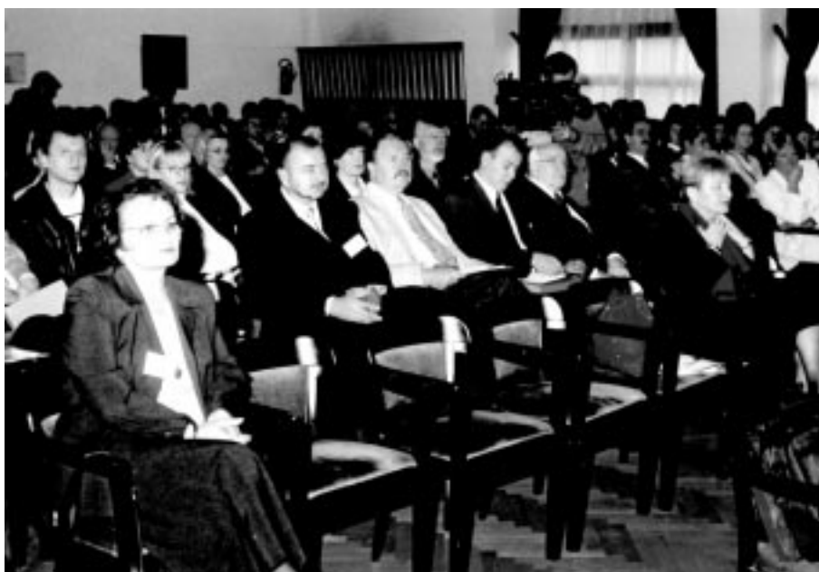
Fig. 3. Participants of the Congress