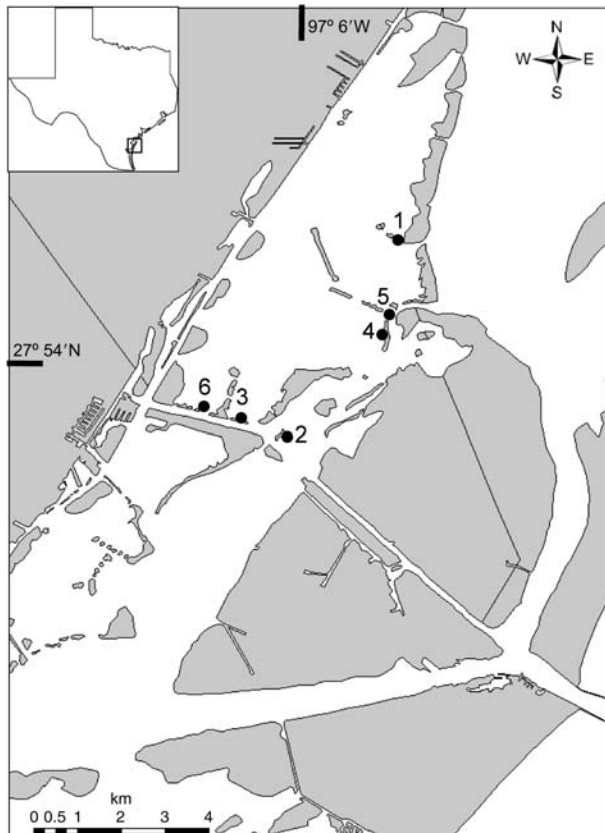
Figure 1 Halodule wrightii : study area in Redfish Bay, Texas, USA.

We undertook this study to examine the effect of propeller scarring on genetic variation in the subtropical seagrass Halodule wrightii (Ascherson) from Redfish Bay, Texas, USA (Figure 1). We developed an amplified fragment length polymorphism (AFLP) assay (Vos et al. 1995) to measure genetic variation from 120 samples distributed among replicated plots representing four levels of propeller scarring: reference (0% removal of vegetation from scarring), low (1–5%), moderate (5–15%) and severe (>15%) (Figure 2). The AFLP assay produced a total of 160 reproducible (98%) markers that were used to score each sample. Scores indicated each sample to be a unique genotype. Marker scores were also used to calculate estimates of population genetic diversity, such as the proportion of polymorphic loci ( P ), mean expected heterozygosity ( H_e ) and Jaccard similarity coefficient ( J ) (Table 1). While severely scarred plots had the lowest, and moderately scarred plots the highest, mean