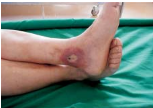
Fig. 1. Venous ulcer.

cal agents failed to produce any substantial improvement, thus the patient was hospitalized. Upon admission, Iruzol ointment was applied, however, in several hours the patient started complaining of severe prickling and itching in the area of the lesion. Pruritus at the site of ointment application turned ever more severe, the patient reported a strong sensation of burning, and the ointment was removed, revealing severe rubor of the area around the lesion. The treatment was continued with the application of alginate compresses. In two weeks, partial epithelialization of the lesion occurred, the lesion size and depth were reduced by half, and the surrounding skin gradually regained normal appearance. Control examination in one month showed complete epithelialization of the lesion, with a residual hypopigmented scar.