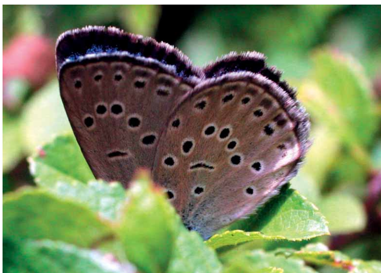
Fig. 2. Maculineaalcon Den. & Sch., August 2006, Grubišnopoljska Bilogora

The locality Grubišnopoljska Bilogora is the first finding site of the M.alcon (Fig. 2) in the Pannonian part of Croatia, and the second for Croatia as a whole. For the first time, M.alcon was recorded for Croatia at the locality Vrelo Koreničko in the