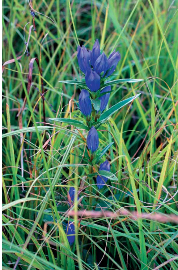
Fig. 5. Gentiana pneumonanthe L. on the locality Grubišnopoljska Bilogora

1758); Argynnis pandora (Denis & Schiffermüller, 1775); Vanessa atalanta (Linnaeus, 1758); Vanessa cardui (Linnaeus, 1758); Araschnia levana (Linnaeus, 1758); Melitaea didyma (Esper, 1778); Melitaea athalia (Rottemburg, 1775); Neptis sappho (Pallas, 1771); Coenonympha glycerion (Borkhausen, 1788); Coenonympha pamphilus (Linnaeus, 1758); Maniola jurtina (Linnaeus, 1758) and Satyrus ferula (Fabricius, 1793).