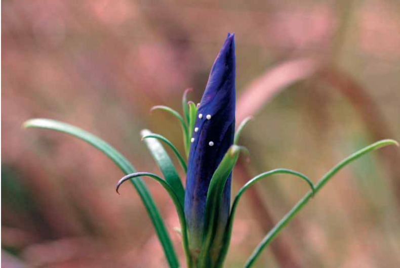
Fig. 3. Gentiana pneumonanthe L. host-plant of the species Maculinea alcon Den. & Sch. – with ova, August 2006, Grubišnopoljska Bilogora

Plitvička jezera National Park when the presence of ova on the larval host plant G. pneumonanthe was determined (ŠAŠIĆ, 2004).