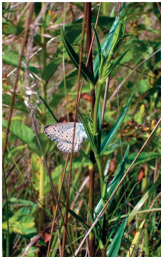
Fig. 4. Laying eggs by female butterflies on the Gentiana pneumonanthe L., August 2006, Grubišnopljaska Bilogora

In the same locality besides M.alcon we found the hesperiid Ochlodes venata (Bremer & Grey, 1853); papilionid Papilio machaon Linnaeus, 1758; pierids Leptidea sp., Pieris napi (Linnaeus, 1758); Colias croceus (Fourcroy, 1785); Gonepteryx rhamni (Linnaeus, 1758); lycaenids Lycaena phleas (Linnaeus, 1761); Lycaena dispar (Haworth, 1802); Cupido argiades (Pallas, 1771); Polyommatus semiargus (Rottemburg, 1775); Polyommatus icarus (Rottemburg, 1775) and nymphalids Argynnis paphia (Linnaeus,