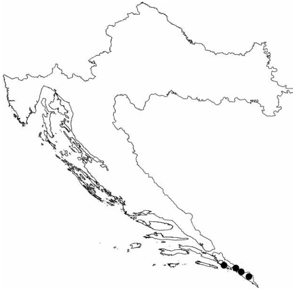
Fig. 2. Distribution of Festuca hercegovinica in Croatia

the lemma dimensions. F. hercegovinica should have glabrous sheaths closed in the lower quarter, and the lemmas 6.2\text{--}7.5 \times 2.1\text{--}2.5 mm; and the species F. hirtovaginata sheaths with dense, patent hairs, open nearly to the base, and lemmas 5.4\text{--}7.1 \times 1.8\text{--}2.2 mm. KOSTADINOVSKI (1999) investigated the range of variability of morphological characters of these species and came to the conclusion that it is much greater than presented by MARKGRAF-DANNENBERG (1978, 1980). Accordingly, he proposed a new taxonomical treatment of these taxa, separating them at the varietal level: F. hirtovaginata (Acht.) Markgr.-Dannenb. var. hirtovaginata and F. hirtovaginata var. hercegovinica (Markgr.-Dannenb.) Kostadinovski (this comb. nova has not been published validly previously and has to be considered as nom. illeg. ). He also came to the conclusion that F. hirtovaginata var. hirtovaginata can have a larger number of veins and ribs on the leaf cross section.