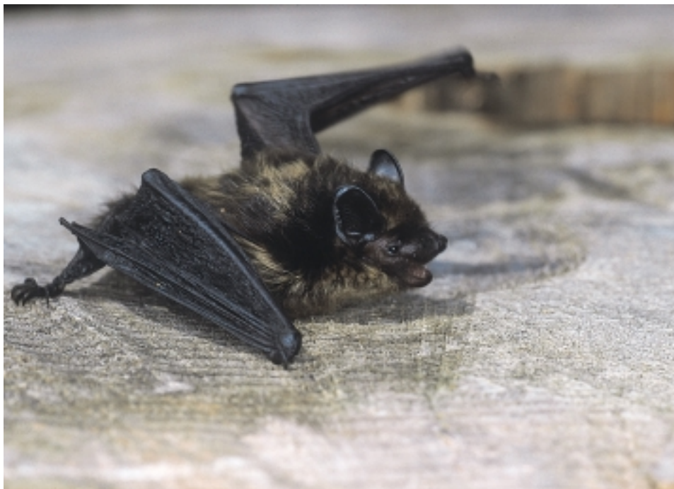
Fig. 2. Northern bat ( Eptesicus nilssonii ) from Mt Velebit.

In 2002, some 130 years later, we finally confirmed this species as a member of the Croatian bat fauna. During three nights in the beginning of August 2002 in two localities (clearings near pools in fir, beech and spruce forest) which are about 7 km apart, three males of the northern bat (Fig. 2) were caught in mist-nets, along with 12 other species of a total of 36 bat specimens. In August, northern bats in the north of Europe undertake up to 30 km long migrations in search of feeding habitats (DE JONG, 1994), and only one longer migration of about 250 km is known (GAISLER et