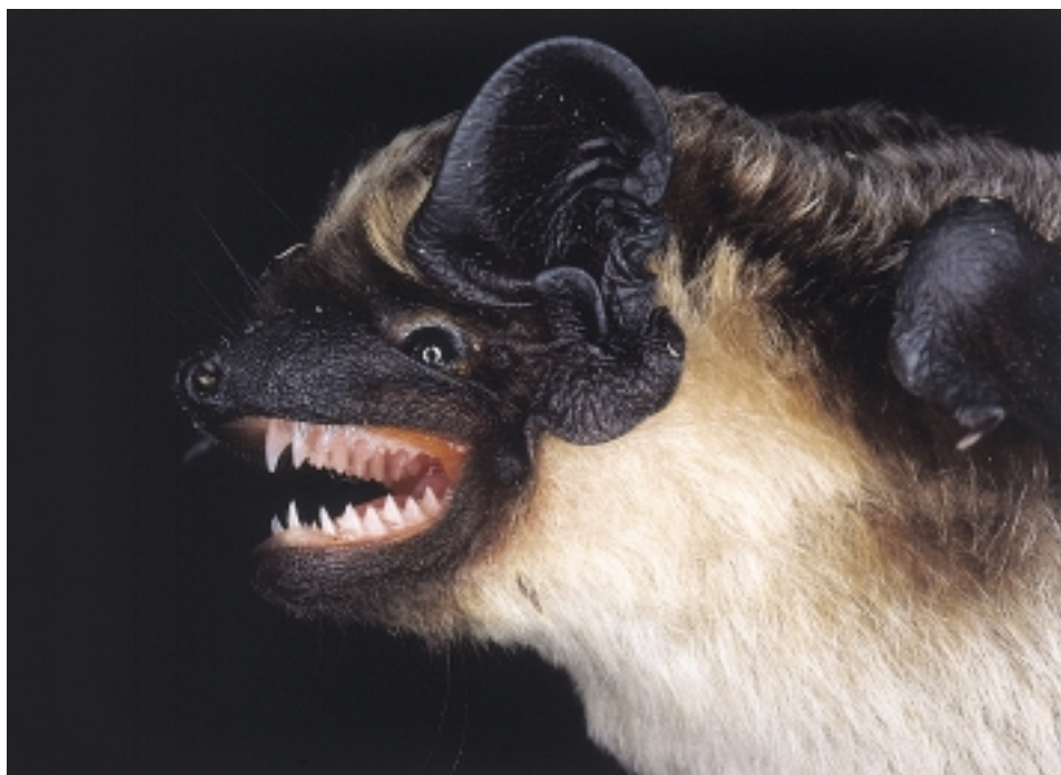
Fig. 1. Parti-coloured bat ( Vespertilio murinus ) from Mt Velebit.

The specimens of parti-coloured bat (measurements of the forearm in Fig. 1) caught in mist-nets on Mt Velebit during September 1998 and at the beginning of August 2002 over pools in clearings of mixed forest of beech, spruce and fir were males. The male from Veliki Lubenovac polje (karst field), before being caught in the net, was observed flying along the forest edge, producing loud calls during flight. These new findings are the first confirmed records of Vespertilio murinus in Croatia after 68 years. They do not allow any decision to be made on the status of this species in Croatia. An accidental finding of a lactating female in the area of Kočevski rog (Slovenia) in a similar habitat (KRYŠTUFEK & ČERVENY, 1997) should warn us to exclude the possibility that this migratory species (MASING, 1989), which moves greater distances than any other European bat, 1,440 km, is resident in the Velebit area.