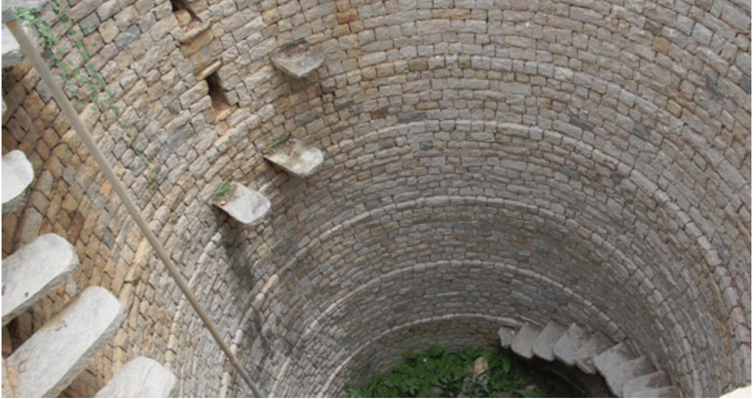
Figure 2. The open wells have dried up in most parts of peninsular India, where borewell pumping has lowered the water table drastically.

The reasons for this situation are several, but a common thread is the non-recognition of the public good nature of the and of the need for public institutions and public science and socially sensitive engineering. On the science side, groundwater monitoring agencies set pumping limits without considering the impacts on surface flows. And their data are largely not in the public domain and not subjected to rigorous scientific analysis. The hard-rock aquifers of peninsular India present a particularly daunting challenge in this regard, but the scientific effort in this regard has been very limited. Similarly, flows in most rivers are either not monitored or the data are not accessible to the public, thereby preventing rigorous analysis for understanding the impacts of human intervention.