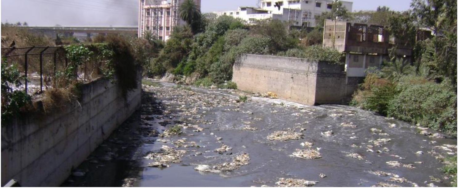
Figure 3. Most rivers near cities have become sewers: the Vrishabhavathy river in Bangalore

constant presence. In structuring these agencies, the issue of transparency and downward accountability to water users potential pollutees has been given the go-by: the governing boards of all these agencies are stacked with bureaucrats w rotating and their CEOs are officers on short-term deputation from other departments. River water dispute tribunals sti meet the workload with very limited access to data or high-quality science.