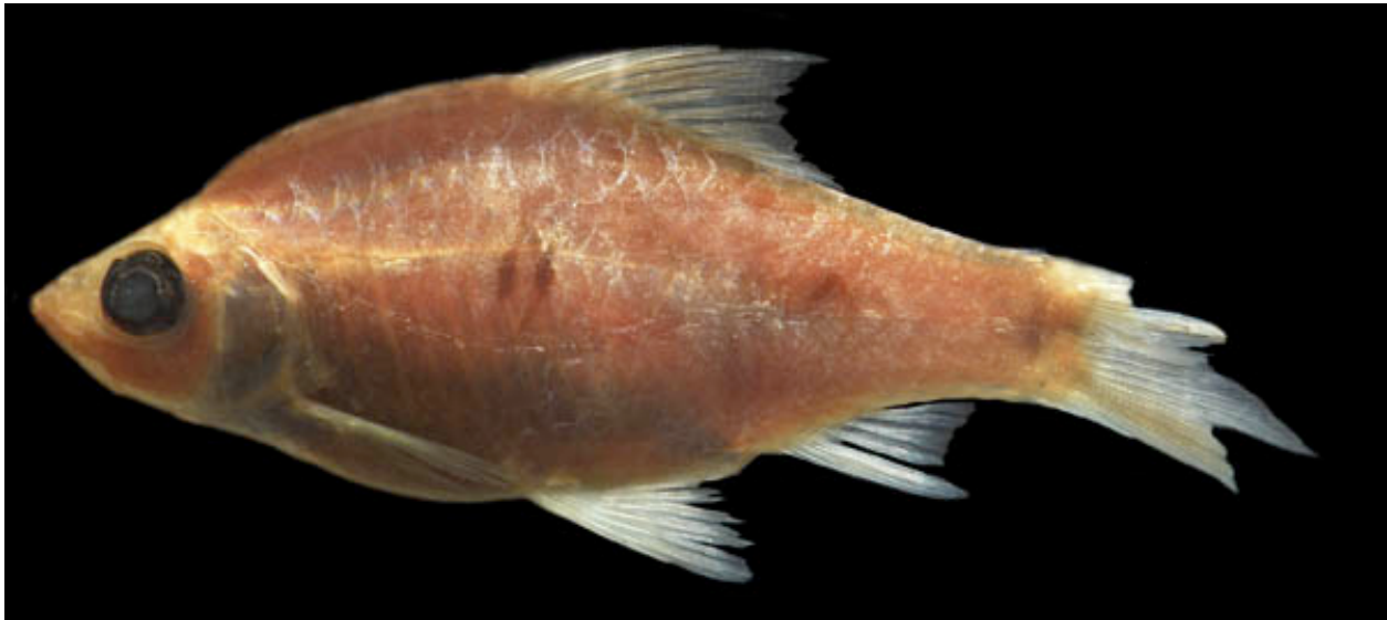
Image 1. Puntius rubrotinctus Neotype, 71.8 mm SL, ZSI/SRS F.8373