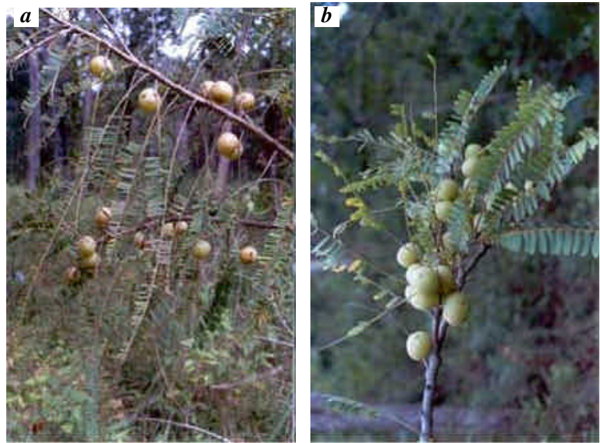
Figure 2. a, Phyllanthus emblica Linn.; b, Phyllanthus indofischeri Bennet.

According to fruit harvesters, the marble green colour with less dark spots due to fungal attack makes the fruits of P. indofischeri more valuable than the fruits of P. emblica . Preferred colour of P. indofischeri can make it more vulnerable to exploitation than P. emblica . Also, market demand for Indian gooseberry fruits is forcing collectors to harvest P. indofischeri . Fruit collectors, lured by money, cut the trees or their major