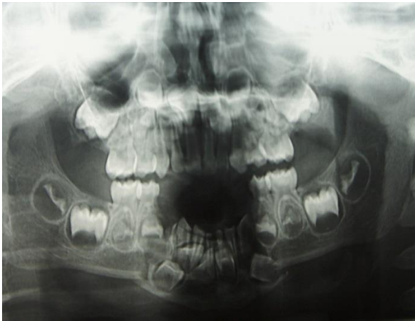
Figure 1. Panoramic view showed bilateral mandibular body fractures with significant displacement.

The Panoramic and PA-mandibular view of the patient after 6 month verified the successful reduction and perfect osseous healing (Fig.5).