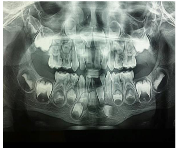
Figure 5. Patient postoperative clinical view after 6 months, Panoramic showed perfect osseous healing and reduction