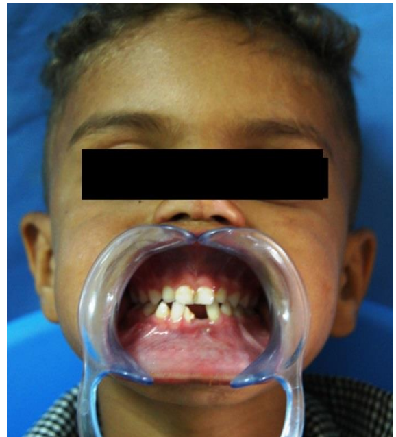
Figure 4. Patient postoperative clinical view after 6 months, with perfect occlusion