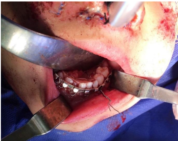
Figure 2. Circum-mandibular wiring to support the lingual splint and mandibular arch bar complex