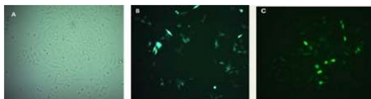
Figure 1. TGIF2LX gene expression detected by fluorescent microscopy. SW48 cells 21 days after post-transfection with a light microscope (A). SW48 cells transfected with empty plasmid pEGFP (B), and with plasmid pEGFP-TGIF2LX (C) under a fluorescent microscope (×20).

The entire coding region of TGIF2LX was cloned into the pEGFP-N1 vector. The TGIF2LX expression was detected by RT-PCR. Plasmids containing the correct sequence were transfected into SW48 cell line, and the TGIF2LX-GFP fusion protein is expressed. The fluorescent microscopic study revealed that the TGIF2LX-GFP was mainly localized to nuclei (Figure 1).