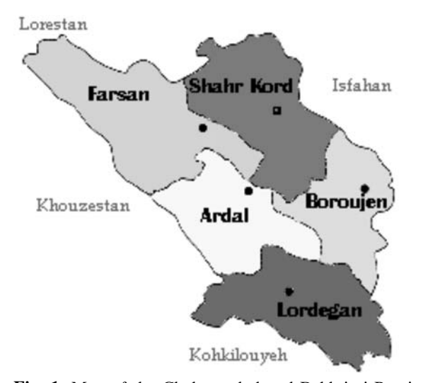
Fig. 1. Map of the Chaharmahal and Bakhtiari Province, Farsan region, where the Dimeh springs are located.

Eighty drinking spring water samples were taken from the Dimeh springs (ten samples for each spring)