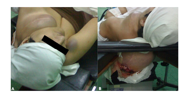
Figure 2 Special position for patient with multiple huge masses. A) Huge neck mass, B) Giant back mass with necrotic tip fitted in the operating table

This made the induction of anaesthesia using the conventional theatre table impossible and therefore the table was modified to create a big hole to accommodate the patient's huge dorsal mass (Figures 2 and 3).