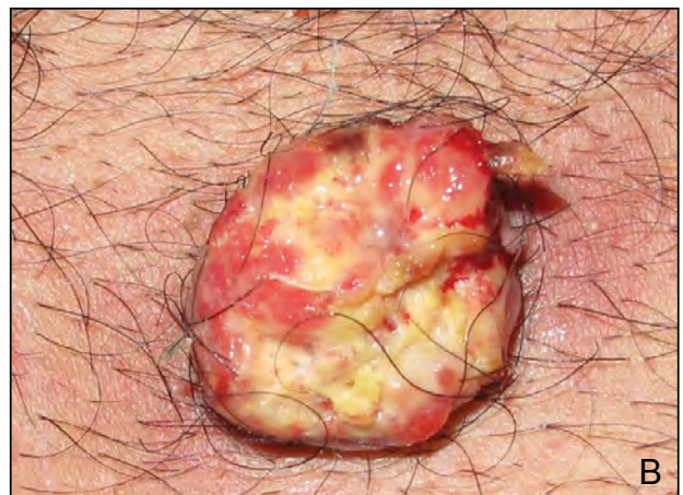
Figure 1. A firm, ulcerated, yellow to red, dome-shaped, nodular mass overlying the chest below the right nipple, measuring 2.5 cm in diameter (A and B).