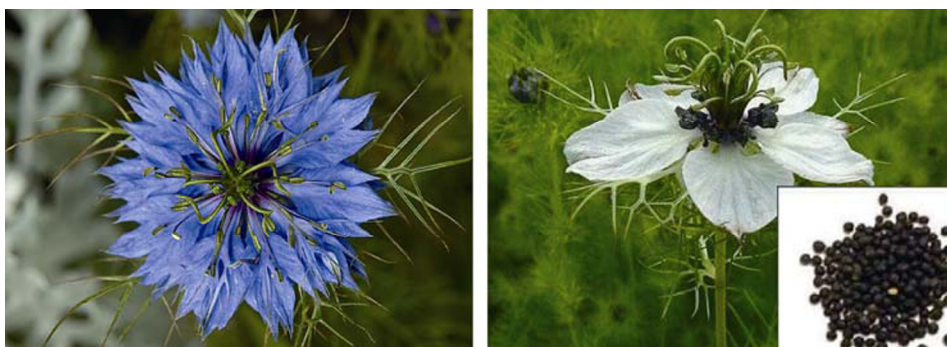
Fig. 1 Nigella sativa

Kingdom: Plantae Division: Magnoliophyt Order: Ranunculales Family: Ranunculacea Genus: Nigella Species: sativa