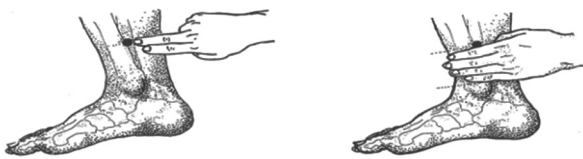
Figure 2. Image for Acupressure Sanyinjiao SP-6 point

emergency cesarean section, administration of the analgesic methods before the study, and reluctance to continue participation in the study.