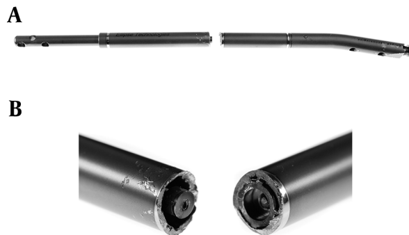
Figure 3. A, B, Nail Breakage in the Middle of the Nail in the PRECICE Nail in the Patient Shown in Figure 2

a prolonged consolidation phase (14, 16, 30). In addition, the weight bearing was likely increased rapidly in this case. Schiedel et al. reported 2 cases of nail breakage during the consolidation in their study of 24 patients. They explained it with increased tension in the nail with the starting consolidation of the bone regenerate or accidental shortening (31).