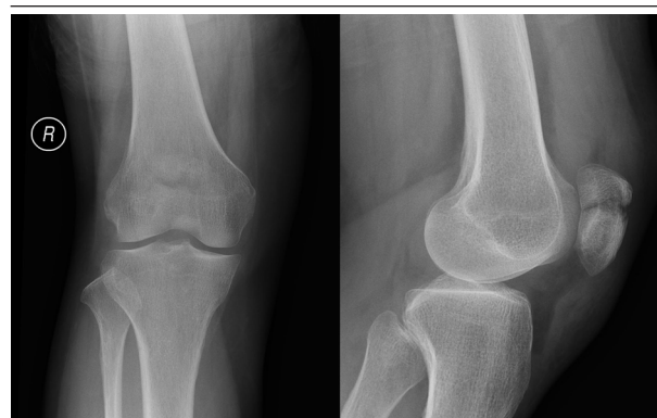
Figure 1. Radiographs Showed Displaced Fracture of the Patient's Right Patella

wards. Clinically, the extensor mechanism of her right knee was lost. Radiographs showed displaced fracture of her right patella (Figure 1). Open reduction and internal fixation was performed. Intra-operatively, it was complicated by a coronal split fracture during tensioning of the cerclage wire. The cerclage wire was reapplied posteriorly. The split fracture was reduced and fixed with five 2 mm screws. The fixation was augmented with a figure-of-eight tension band wire (Figure 2). Post-operatively, a hinged knee brace was applied. The knee was immobilized in extension for two weeks and gradual mobilization in the brace for another six weeks. Bone densitometry was checked after the operation. The T score was -1.4. The fracture healed eight weeks after the operation (Figure 3). Upon 24 months of follow-up, the range of motion of her right knee was 0 to 100 degrees of flexion. There was some knee discomfort during flexion by irritation of the wire loop. The patient refused removal of the implants.