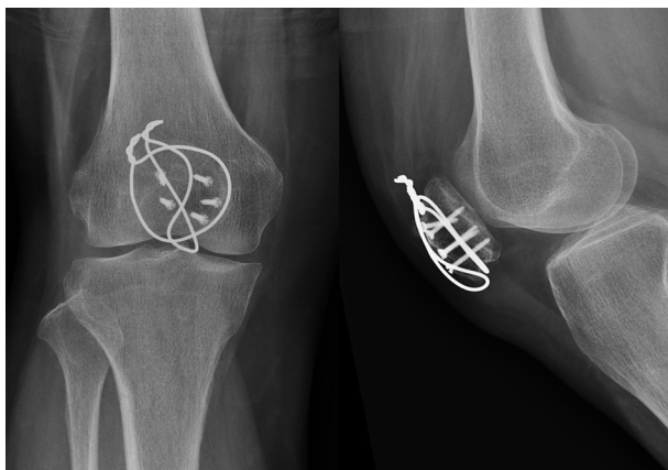
Figure 3. The Radiographs Showed That the Fracture Was Healed