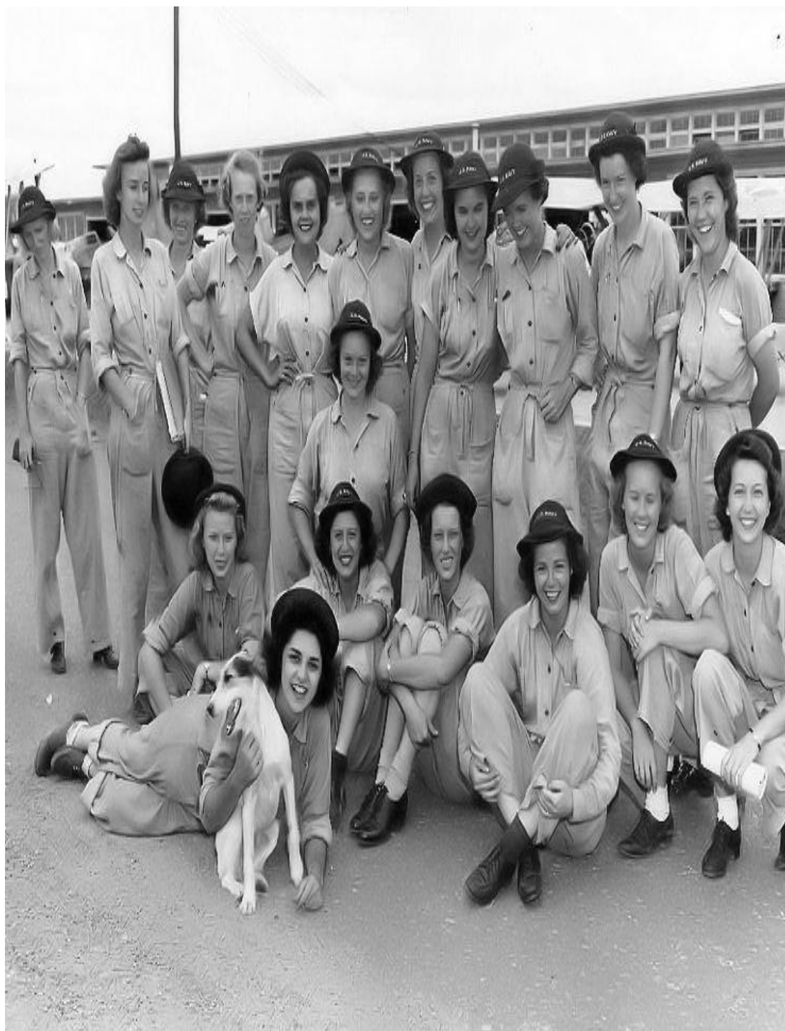
WAVES at the Naval Air Technical Training Center in Norma, Oklahoma in 1943.