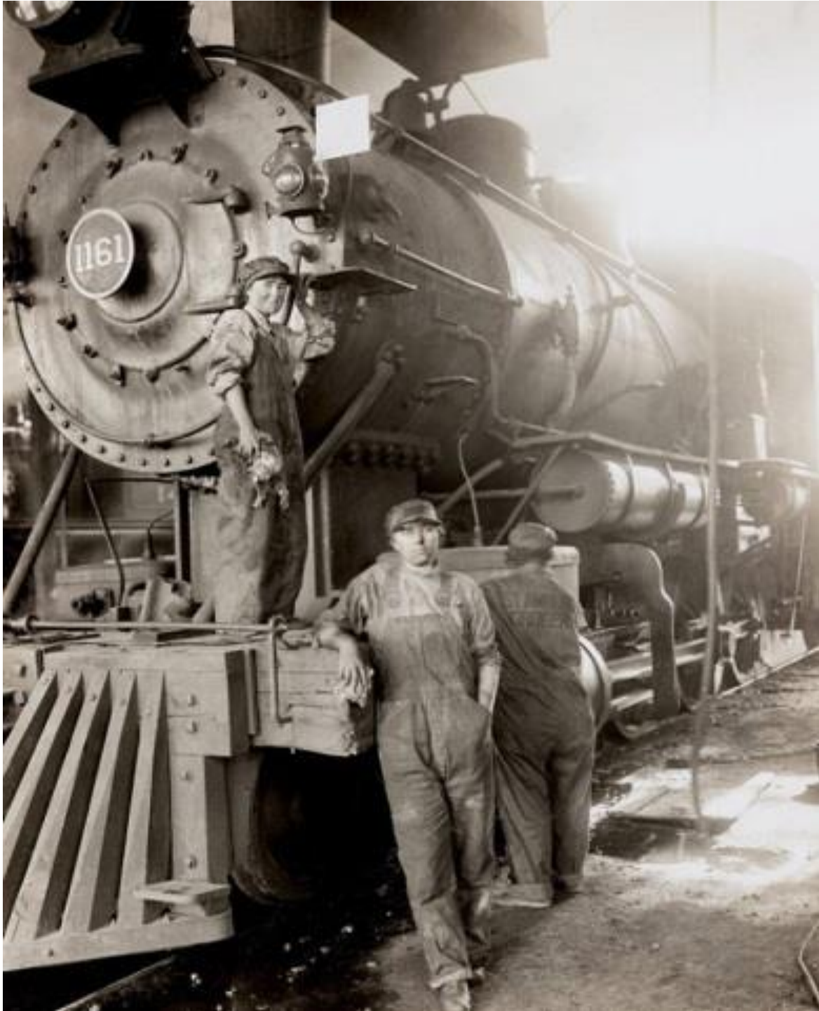
Women working on the Great Northern Railway in Great Falls, Montana in 1918.