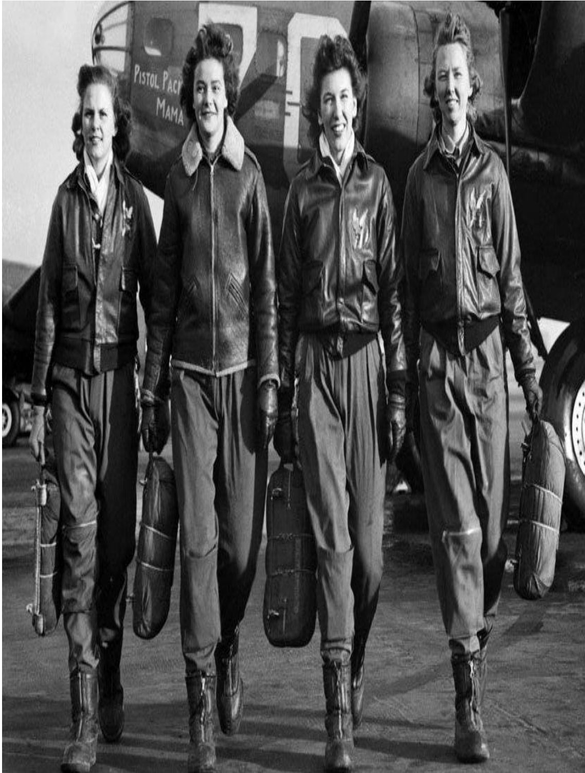
WASPs at the Lockbourne Army Air Force Base in Ohio.