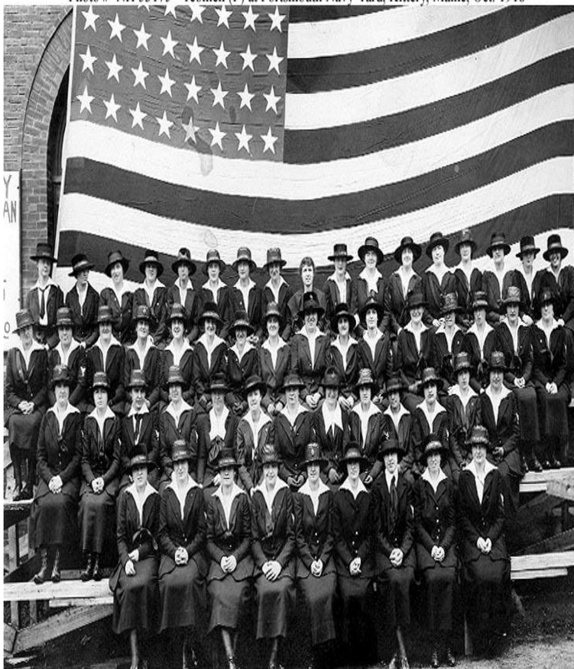
Members of the Navy Nurse Corps, known as “Yeomen” in Kittery, Maine in 1918.