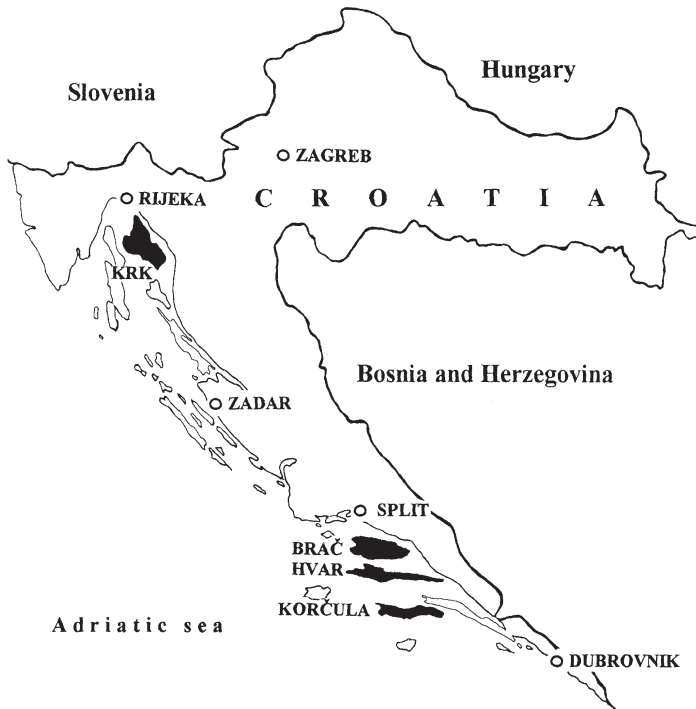
Fig. 1. Location of the study regions in Croatia