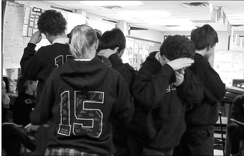
FIGURE 2. Students sculpt responses to lines from Anne's diary and their own journal writings.