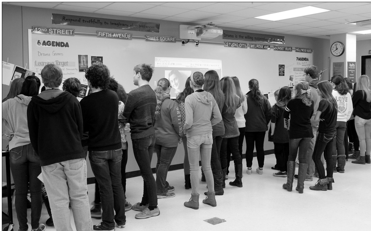
FIGURE 1. Students stand solemnly, in close proximity to each other, and as one unit in front of the cordel.

Even though it was a still and solemn experience for students, the slow and deliberate movement involved in this activity and the proximity of bodies to each other and the text, as well as the invisible bonding that occurred during the close examination of the artifacts, immersed students in