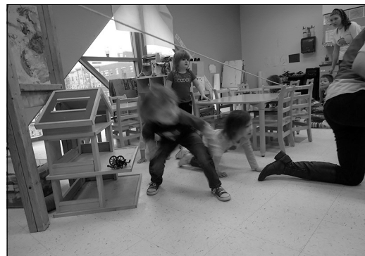
Figure 2. Children in Christie’s class scurried under the castle door to rescue the Silver Harp.

As illustrated in Hillary’s scooting and in Figure 2, the children’s “movements [were] not random actions, but rather represent[ed] a state of consciousness involving full engagement and awareness” (Wee, 2009, p. 496). In each of these moments, the children enacted the events of the story, used their bodies to make meaning; they became the story.