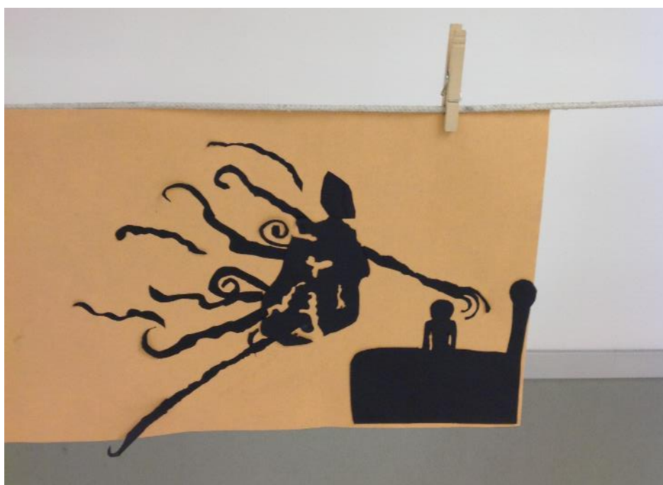
Figure 3. Brittany's visual art response to the word "scared."

Brittany chose the word Scared and took care to create the image in Figure 3 to express it. In it, a shape that is at once beautiful and disturbing overwhelms the space of the page. It appears to be a creature with tendrils that flow behind and around it, even extending beyond the frame of the paper. Much smaller, a body sits upright in a bed in the right bottom corner. The creature's spooky long arm, with several bony long fingers, reaches toward the child-like body.