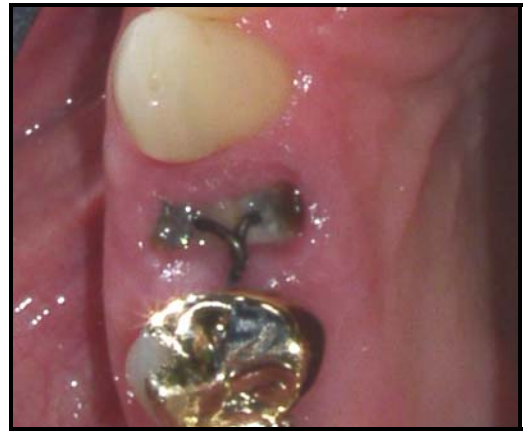
Figure 3. a) Standard pre-op buccal; b) Standard pre-op occlusal