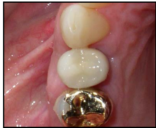
Figure 3. c) Standard crown placement buccal; d) Standard crown placement occlusal