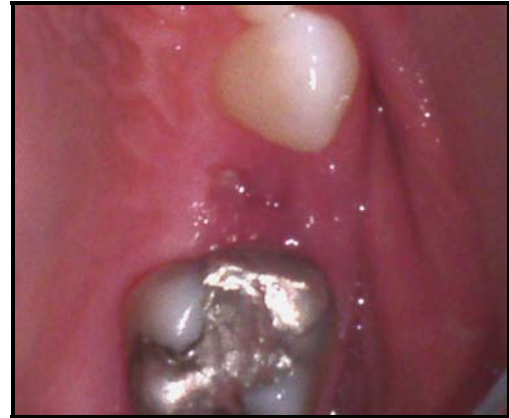
Figure 2. a) Scalloped pre-op buccal; b) Scalloped pre-op occlusal