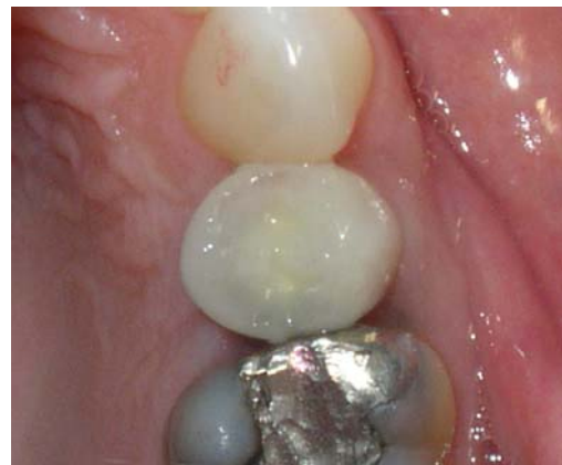
Figure 2. c) Scalloped crown placement buccal; d) Scalloped crown placement occlusal