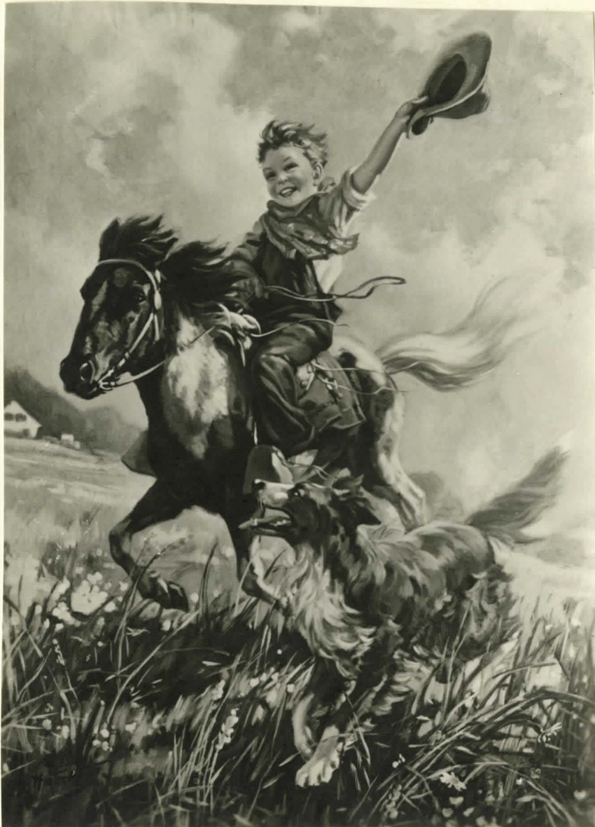
Picture to illustrate speech strips and paragraph of the pre-test The original is 12 by 16 inches and in clear bright colors.