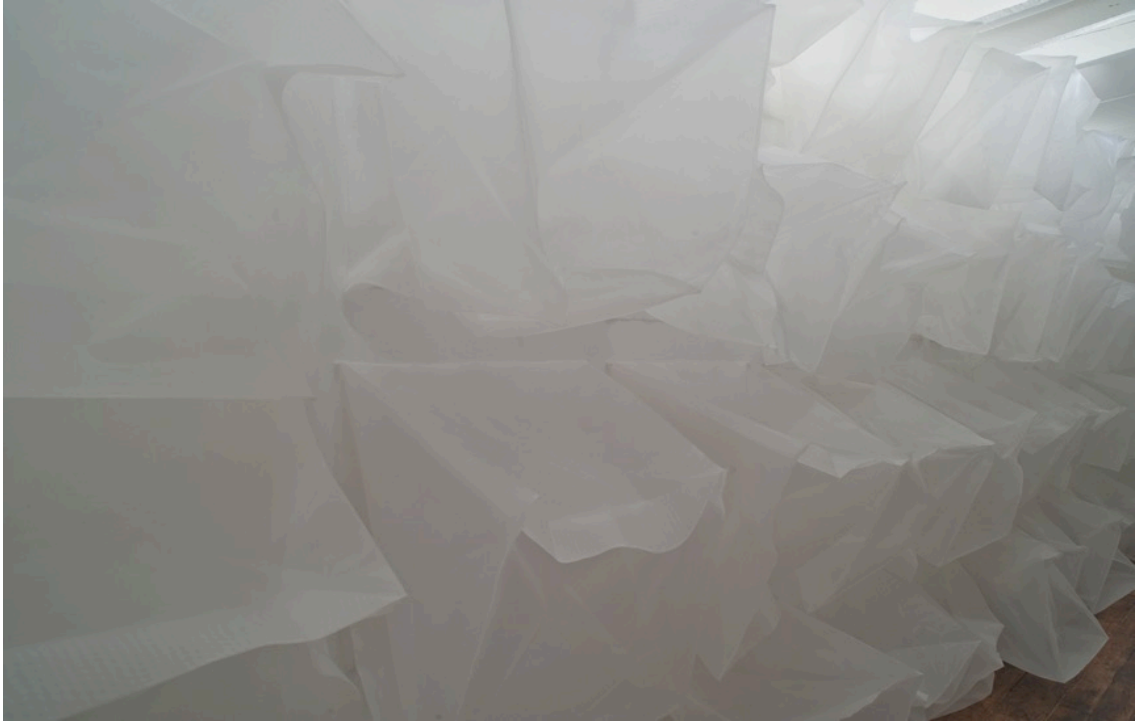
Chris Rattke, Ghost (wall) 68 (detail), 2011. Nylon mesh, monofilament. 24 x 24 x 22 each Photograph by Sarah Lyon.