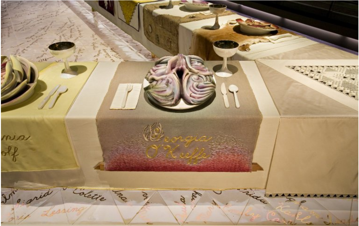
Figure 14 : Judy Chicago, The Dinner Party (Georgia O'Keeffe runner) , 1979. Belgian linen, cherry wood stretcher bars, cotton/linen base fabric, woven interface support material (horsehair, wool, and linen), cotton upholstery, steel carpet tacks, silk, synthetic gold cord, airbrushed acrylic paints, silk thread Plate: Porcelain with overglaze enamel (China paint). Runner: 52 1/4 x 32 1/4 in. (132.7 x 81.9 cm) Plate: 14 1/2 x 14 x 4 3/4 in. (36.8 x 35.6 x 12.1 cm). Image from: Brooklyn Museum website.