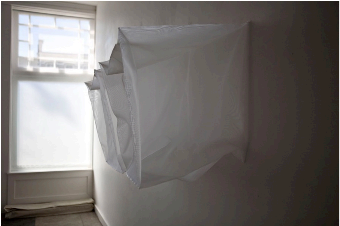
Figure 1 : Chris Radtke, Ghost 2 (study) , 2009. Nylon mesh, monofilament. 24 x 24 x 22 each. Photograph by Sarah Lyon.

Timothy Mazik took the image of Deflated during the exhibition Trace of a Body .