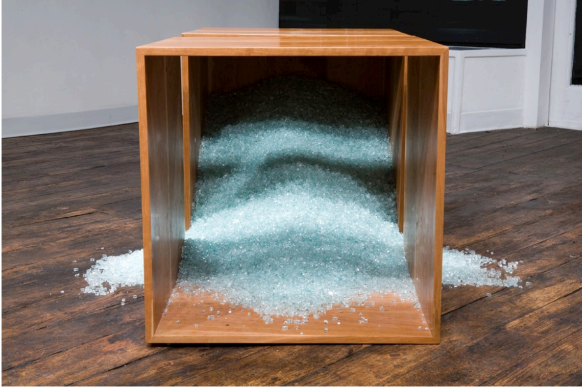
Figure 8 : Chris Radtke, Crouch , 2008. Cherry, shattered glass.