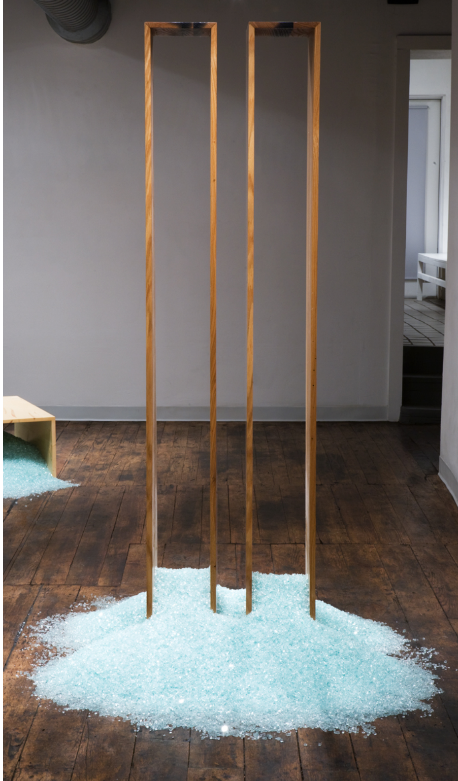
Figure 9 : Chris Radtke, Reach , 2008. Oak, shattered tempered glass.