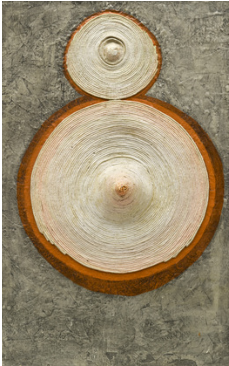
Figure 12: Eva Hesse, Ringaround Arosie , 1965. Pencil, acetone, varnish, enamel paint, ink, and cloth covered electrical wire on papier-mâché and masonite, 26 3/8 x 16 1/2 x 4 1/2" (67 x 41.9 x 11.4 cm).