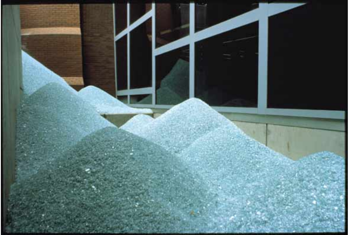
Figure 15: Maya Lin, Groundswell , 1993. Tempered safety glass. Permanent installation, commissioned by the Wexner Center for the Arts with support from the Wexner Center Foundation.