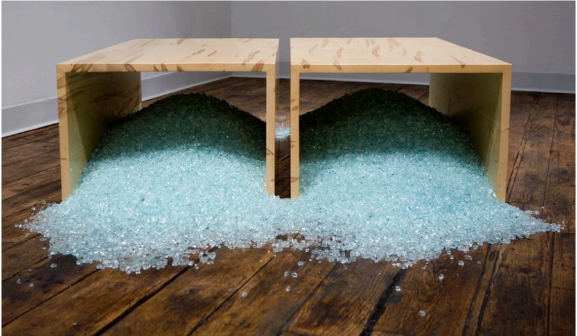
Figure 7 : Chris Radtke, Curl , 2008. Box elder, shattered tempered glass. 13 \frac{3}{4} " x 20" x 35 \frac{1}{2} " each.