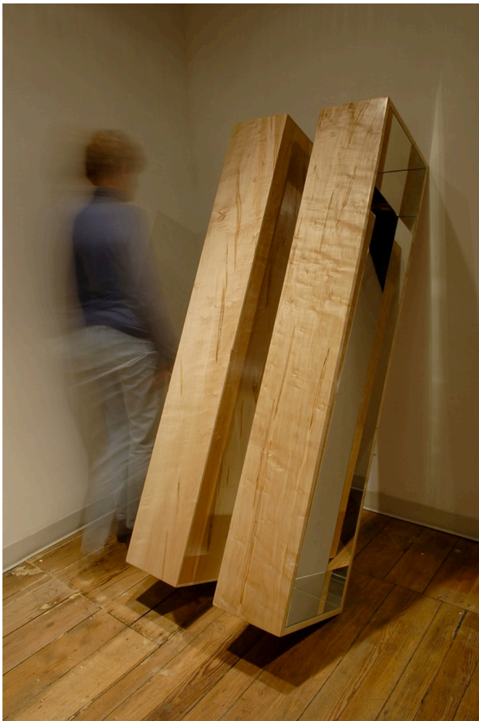
Figure 5 : Chris Radtke, Self 2 , 2006. Ambrosia maple, mirror. 15 ½” x 15 ¾” x 9 ½” each.