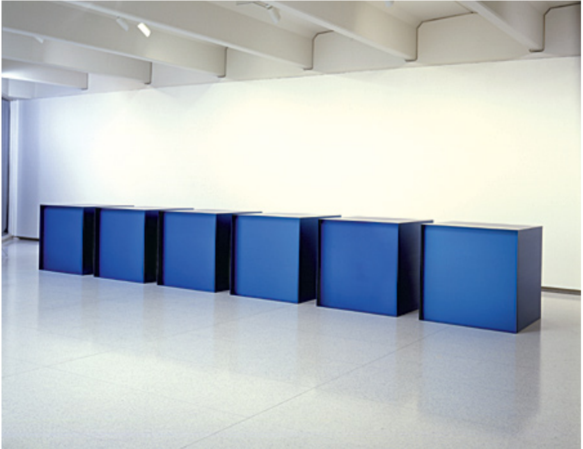
Figure 10 : Donald Judd, untitled , 1971. Anodized aluminum. 48 x 48 x 48 in. each of 6 boxes, 48 x 108 x 48 in. overall installed. Collection Walker Art Center, Gift of the T. B. Walker Foundation, 1971.