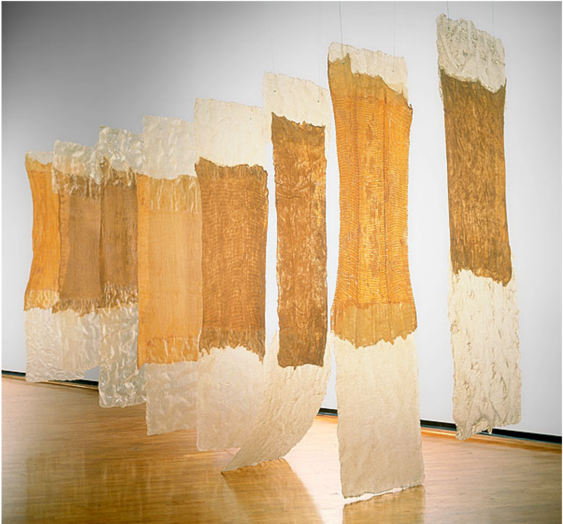
Figure 13 : Eva Hesse, Contingent , 1969. Cheesecloth, latex, fiberglass. Overall 350.0 (h) x 630.0 (w) x 109.0 (d) cm. Purchased 1973. National Gallery of Australia, Canberra.