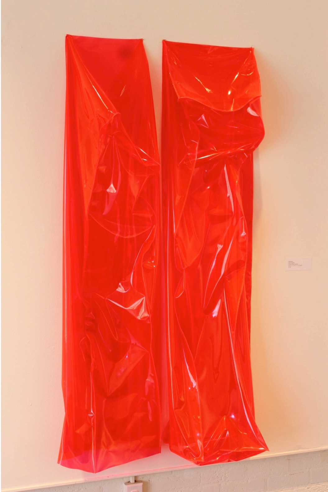
Figure 3 : Chris Radtke, Deflated , 2014. Tinted neon plastic. 65 ½” x 15 ¾” x 11 ½” each.