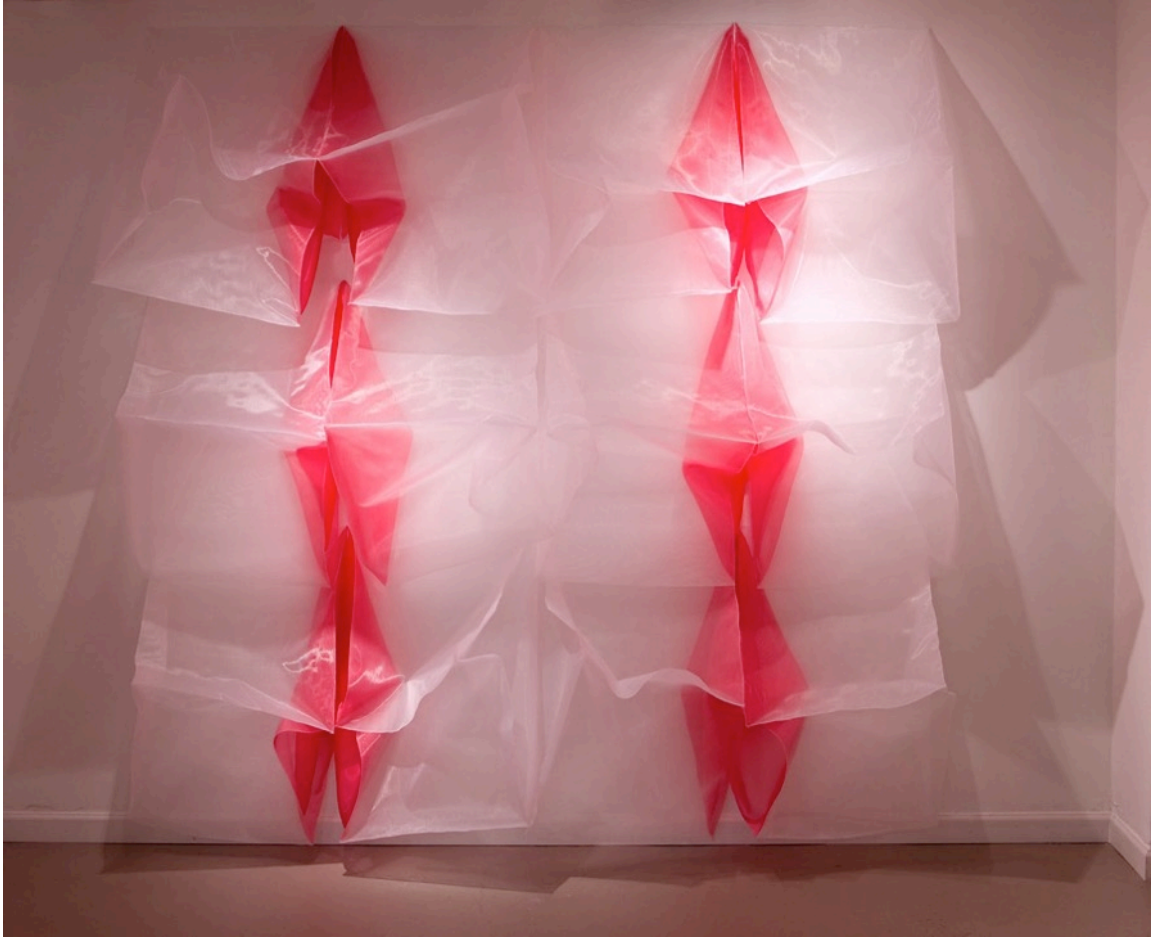
Figure 2: Chris Radtke, Pink (wall) 12 , 2012. Nylon mesh, monofilament. 24 x 24 x 22 each.