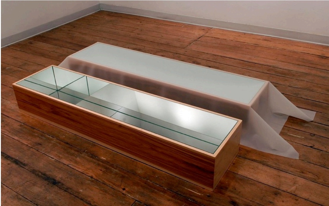
Figure 6 : Chris Radtke, Self 3 , 2006. Ash, mirror, liquid vinyl. 15 ½” x 15 ¾” x 9 ½” each.