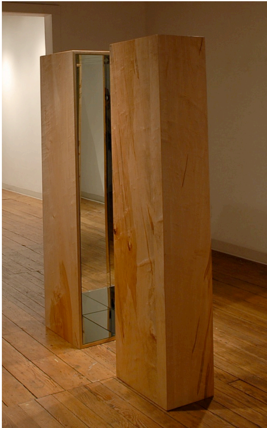
Figure 4 : Chris Radtke, Self 1 , 2006. Ambrosia maple, mirror. 15 ½” x 15 ¾” x 9 ½” each.