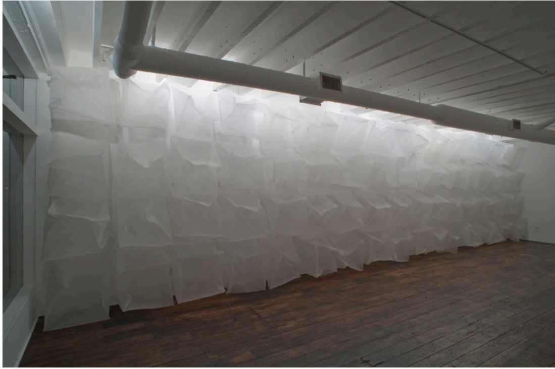
Chris Rattke, Ghost (wall) 68 , 2011. Nylon mesh, monofilament. 24 x 24 x 22 each