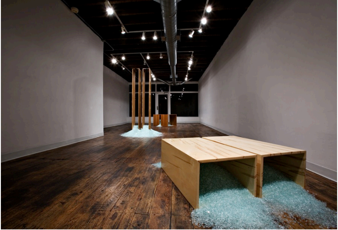
Chris Radtke, Curl , install shot, 2008. Box elder, shattered tempered glass. 13 \frac{3}{4} " x 20" x 35 \frac{1}{2} " each.