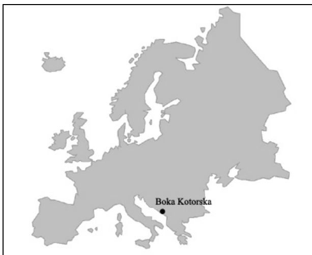
Fig. 1 Geographical position of Boka Kotorska

This area, inhabited since the oldest times, standing out in preroman Illyrian thalassocracy on the Adriatic, preserved great importance in traffic-geographical valuation in the periods of Antiquity and Middle Ages. From 1420 to 1918 (1929) administrative-political affiliation of Boka Kotorska area was connected with the Dalmatian South Croatian territory except the corridor of Sutorina which made part of Herzegovinian territory. From then it was mostly connected with Montenegrin (or Zeta Banovina, 1929-1944) territory, and after W.W. II it was almost completely annexed to Montenegro within the borders of communist Yugoslavia. Only a smaller part of Vitaljina exit into the most open part of the bay from the cape Oštra to the western cape of the cove Čipavica, being centennial South Croatian territory of Dubrovnik and Dalmatia, remained within the borders of the Federal Republic of Croatia. After the break-up of the S.F.R. Yugoslavia in 1991, Boka Kotorska, on the basis of the international recognition of ex Yugoslav republics' borders, remained mostly within the borders of Montenegro i. e. of the S. R. Yugoslavia and its smaller part within the borders of the Republic of Croatia.