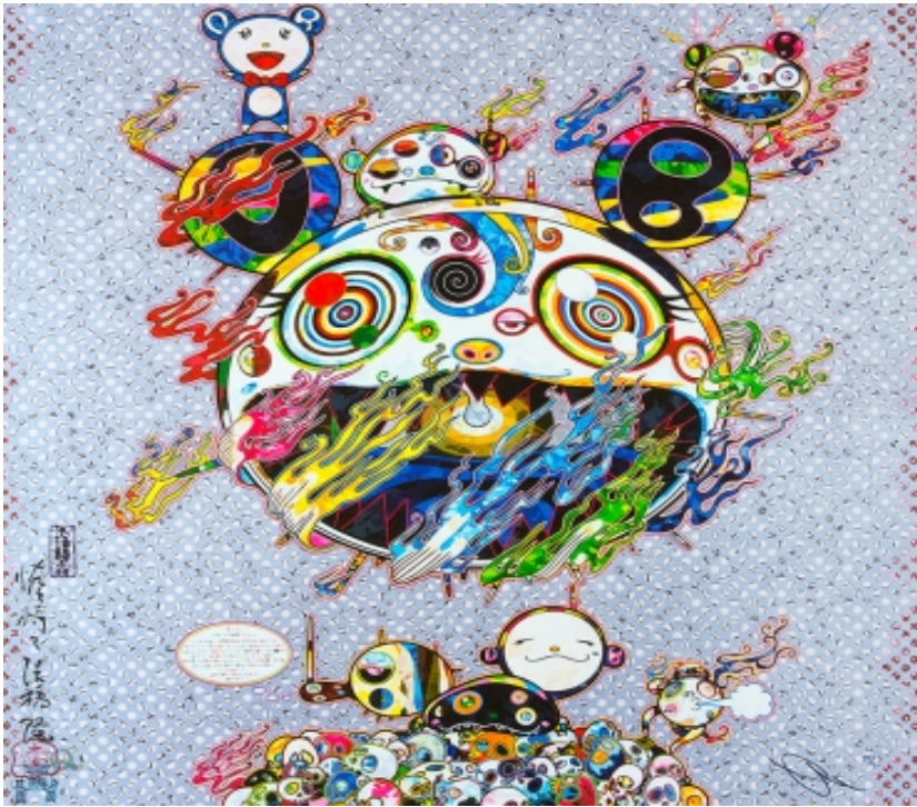
Figure 6. Takashi Murakami, Chaos , 2013, 300 x 300 cm, (9.80 x 9.80 feet).