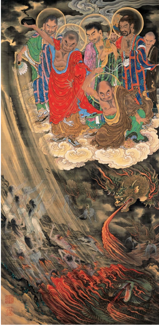
Figure 13. Kano Kazunobu (1816-63), The Six Realms: Hell , from Five Hundred Arhats , 1854-63, Scroll 23 from a set of 100, Hanging scroll, ink and color on ink, 172.3 x 85.3 cm, Collection of Zojoji, Tokyo, Japan.