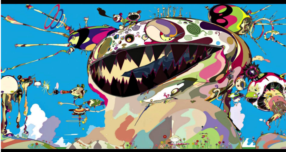
Figure 4. Takashi Murakami, Tan Tan Bo Puking , 2001, acrylic on canvas mounted on board, 141 3/4 x 212 5/8 in (3.6 x 5.4 m).