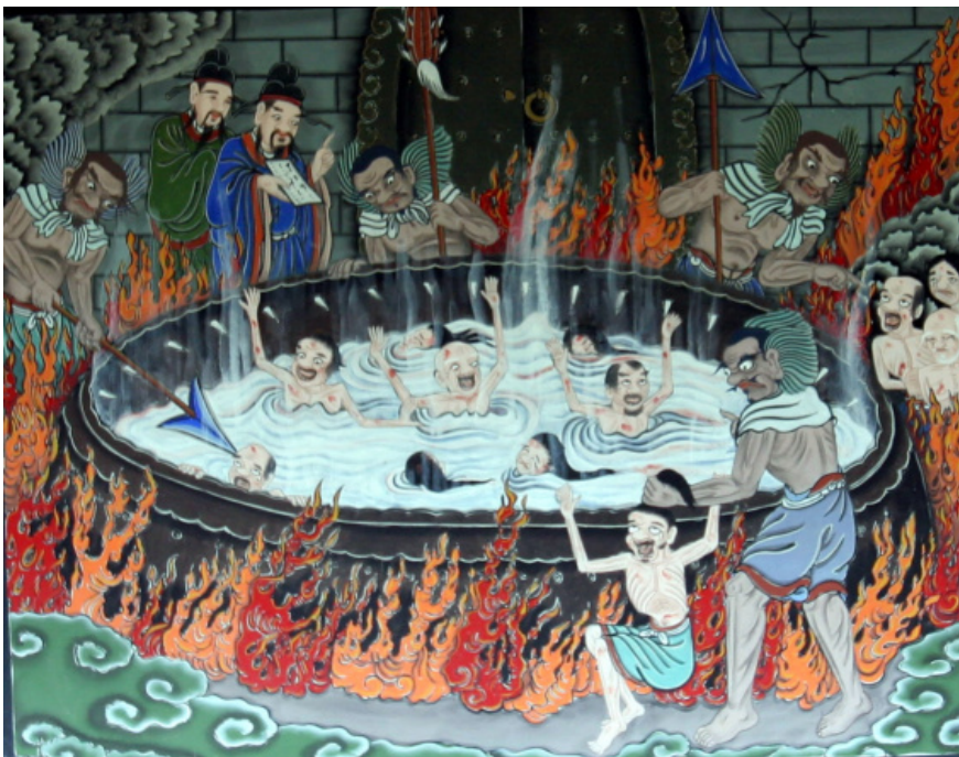
Figure 6-1, The hell of liquid fire painting 火湯地獄圖, Ssangbong temple.