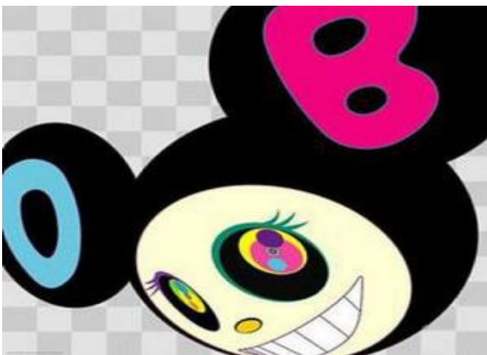
Figure 1-1. Takashi Murakami, Mr. DOB , 1998, Synthetic polymer paint on canvas, 280 x 300 x 7.5 cm.