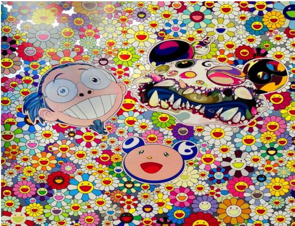
Figure 5. Takashi Murakami, Me and Double-DOB , 2009, 300 x 300 cm (9.80 x 9.80 feet).