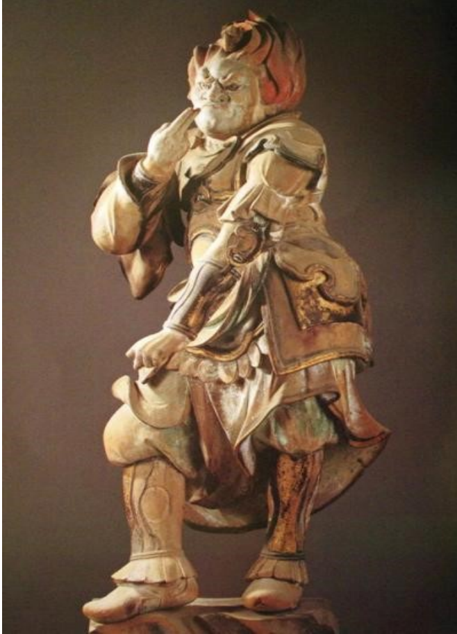
Figure 3-2, One of The twelve general divine standing sculptures 十二神将立像, Muro-ji temple 室生寺 Kamakura period (1185-1333).