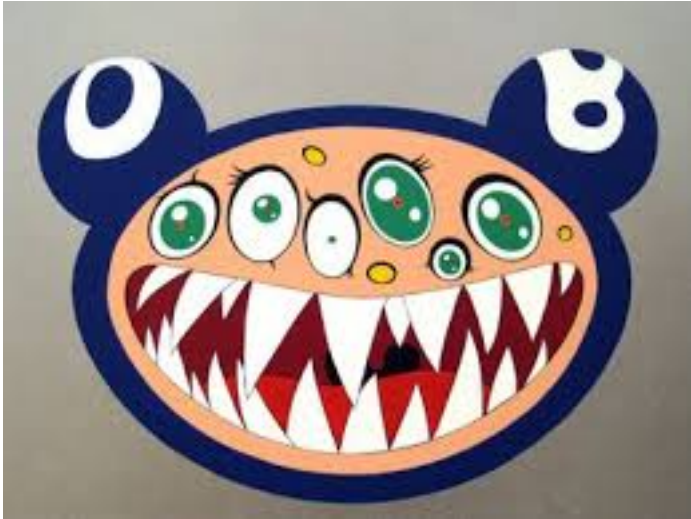
Figure 1. Takashi Murakami, Mr. DOB , 1998, Synthetic polymer paint on canvas, 280 x 300 x 7.5 cm.