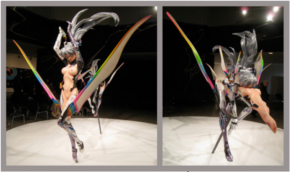
Figure 2. Takashi Murakami, Second Mission Project Ko 2 , 1997, 9 foot (2.7 m), oil paint, acrylic, iron, fiberglass and synthetic resin figure.