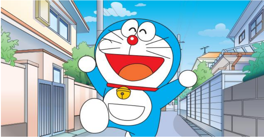
Figure 7. Doraemon , 1969.