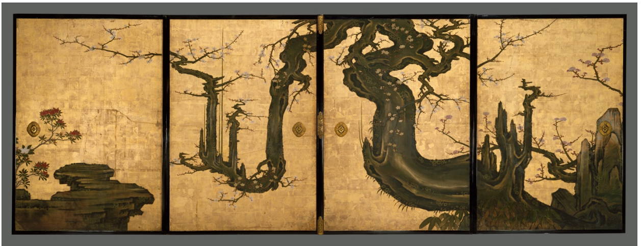
Figure 10. Kano Sansetsu, Old Plum 老梅図襖, 1646, Four sliding-door panels (fusuma); ink, color, gold, and gold leaf on paper, 68 3/4 x 191 1/8 in. (174.6 x 485.5 cm).