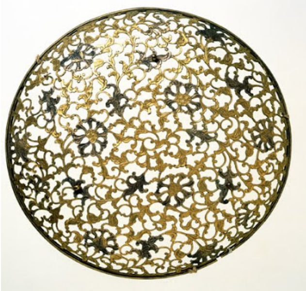
Figure 9. Openwork keko (A flower basket) , the 12 th -13 th century, Jinsyoji Temple, Japanese national treasure.