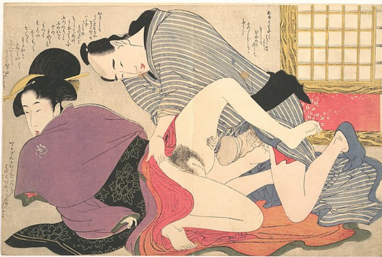
Figure 3-3. Kitagawa Utamaro, Shunga (Erotic print), Edo period (1615-1868), Polychrome woodblock print, ink and color on paper, Mat 15 1/2 × 22 3/4 in. (39.4 × 57.8 cm).