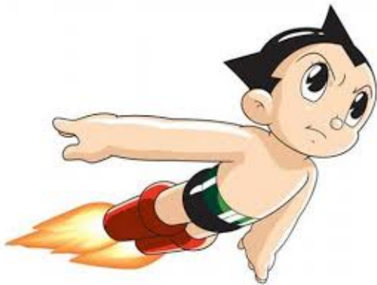
Figure 3-1. Astro Boy (or Mighty Atom ), 1952.