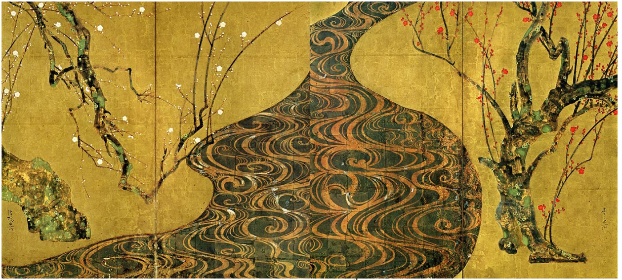
Figure 11. Ogata Korin, Red and White Plums , early 18 th century, pair of two-panel folding screens, ink, colors and gold on paper, each screen 5.2 x 5.8 in. (1.6 x 1.7 m). MOA Museum of Art, Atami.