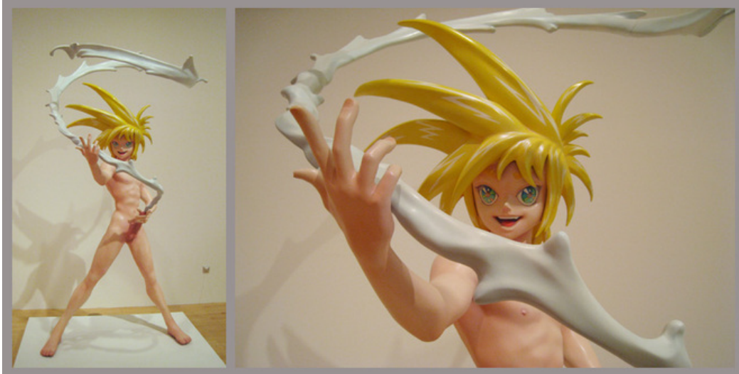
Figure 3. Takashi Murakami, My Lonesome Cowboy , 1998, 8ft. 4 1/8 in x 3ft. (254 x 117 x 91.5 cm) oil paint, acrylic, iron, fiberglass and synthetic resin figure.