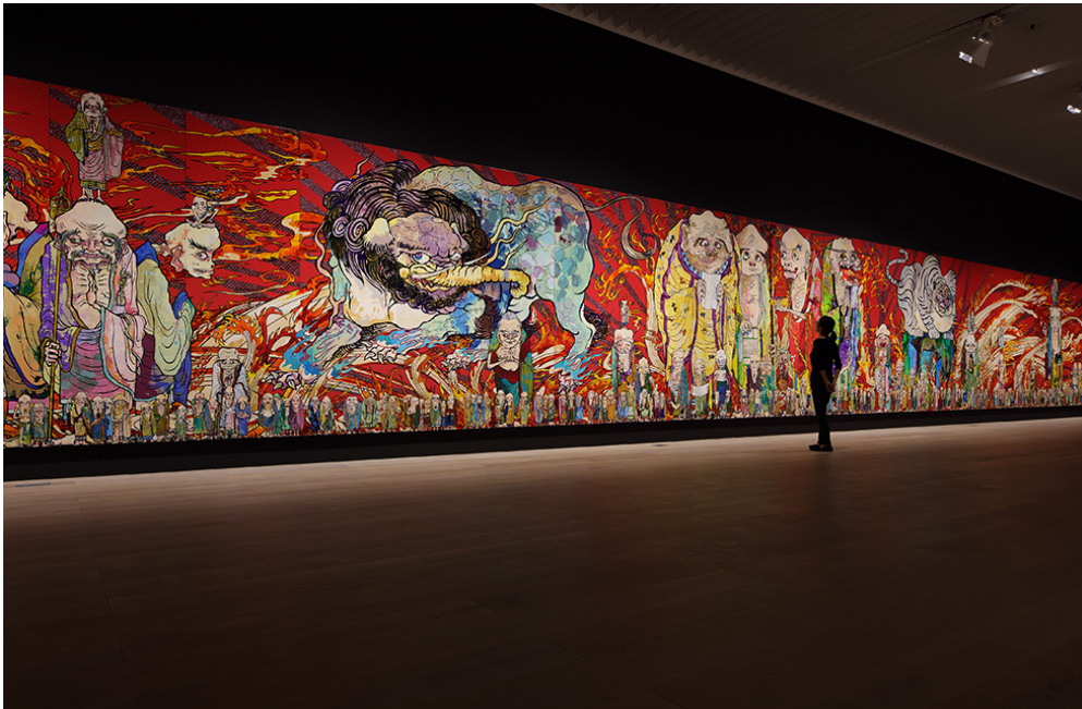
Figure 8. Takashi Murakami, The 500 Arhats , 2012, Acrylic on canvas mounted on board, 302 x 10,000 cm.