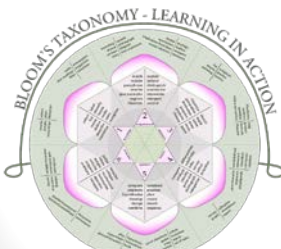
Image licenced under creative commons by K. Aainsqatsi http://en.wikipedia.org/wiki/File:Blooms_rose.svg