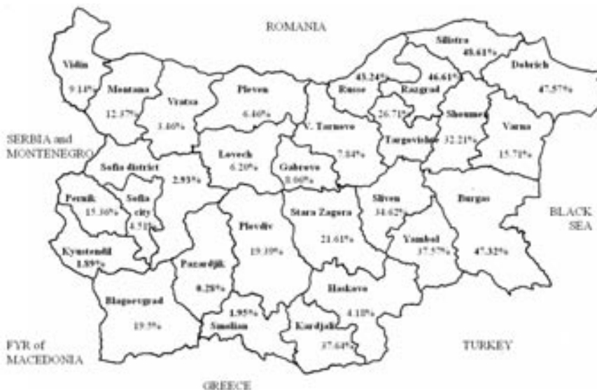
Fig. 2. Incidence of bovine enzootic leukosis in the Republic of Bulgaria in 2004

Fig. 2. presents data on serological analyses made in 2004 by regions. From 254,124 tested animals, the number of seropositive reagents was 56 529 (22.26%). The highest percentage of seroreagents was observed in the regions of Silistra (48.61%), Dobrich