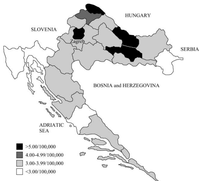
Fig. 1. Prevalence of sarcoidosis by counties.

year (3.0/100,000; odds ratio [OR], 1.54; 95% confidence interval [CI], 1.34–1.77; p < 0.001 ).